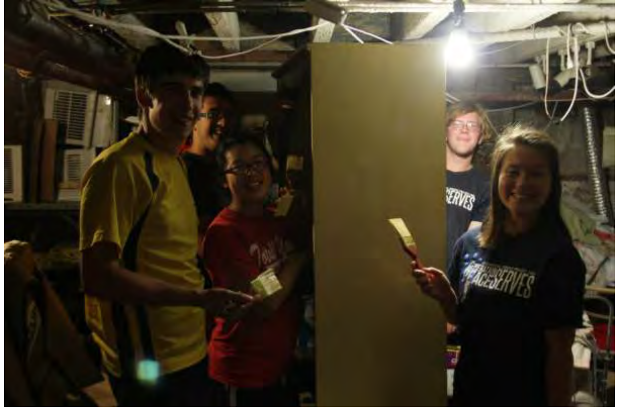
Thursday: Half the group painted the Sunday school shelf. Even though it lives in the basement and no one sees it except for the younger kids once a week, we're hoping that even a small change can help the kids start to take ownership.

The other half of us researched some educational material and prepared a few lessons.