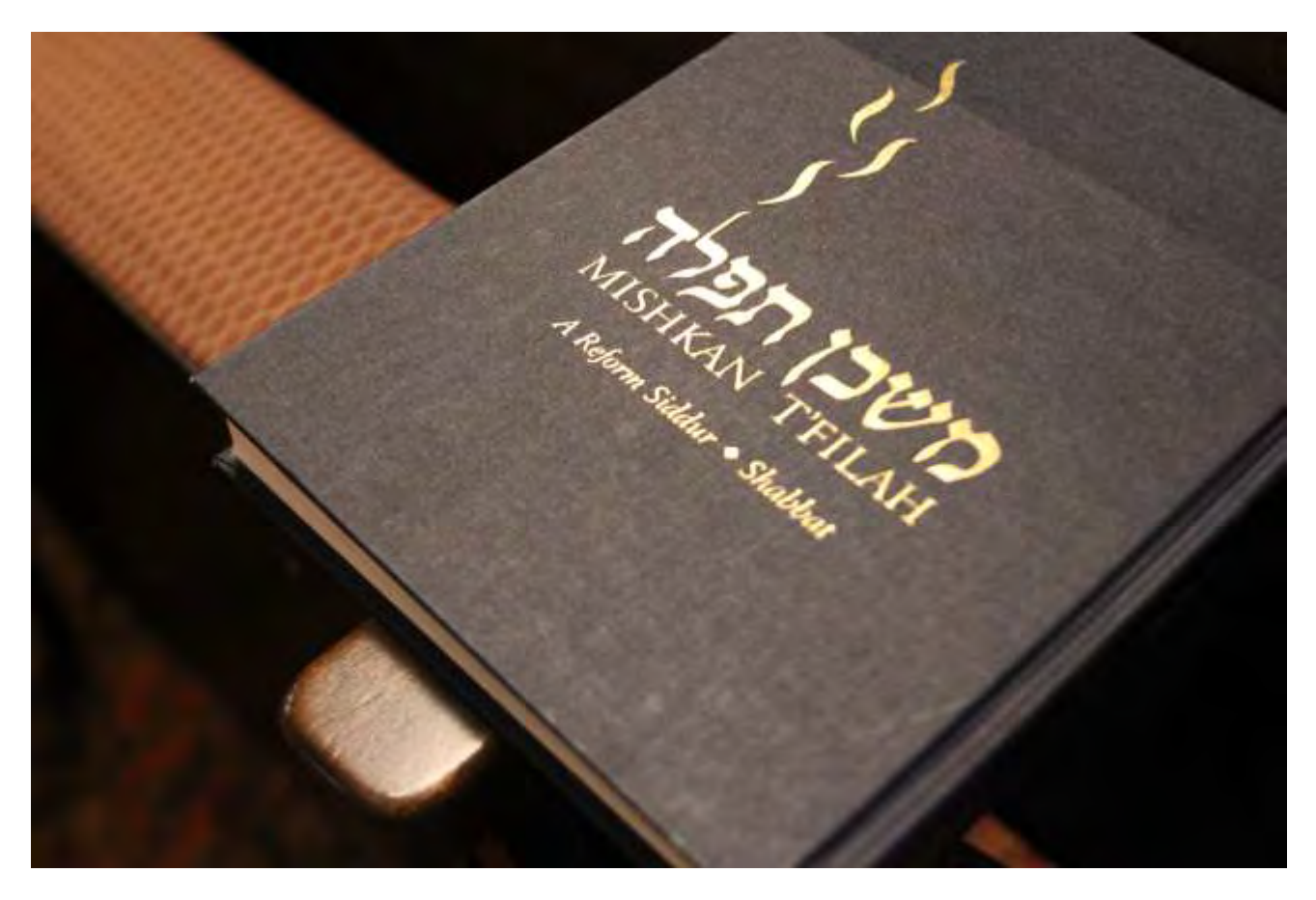
On Friday afternoon before the workshop, we also had the opportunity to visit a synagogue downtown, called Rodeph Shalom. They practice a branch of Judaism called Reform Judaism, and adapt their external approach to be more modern without sacrificing their tradition and morals.