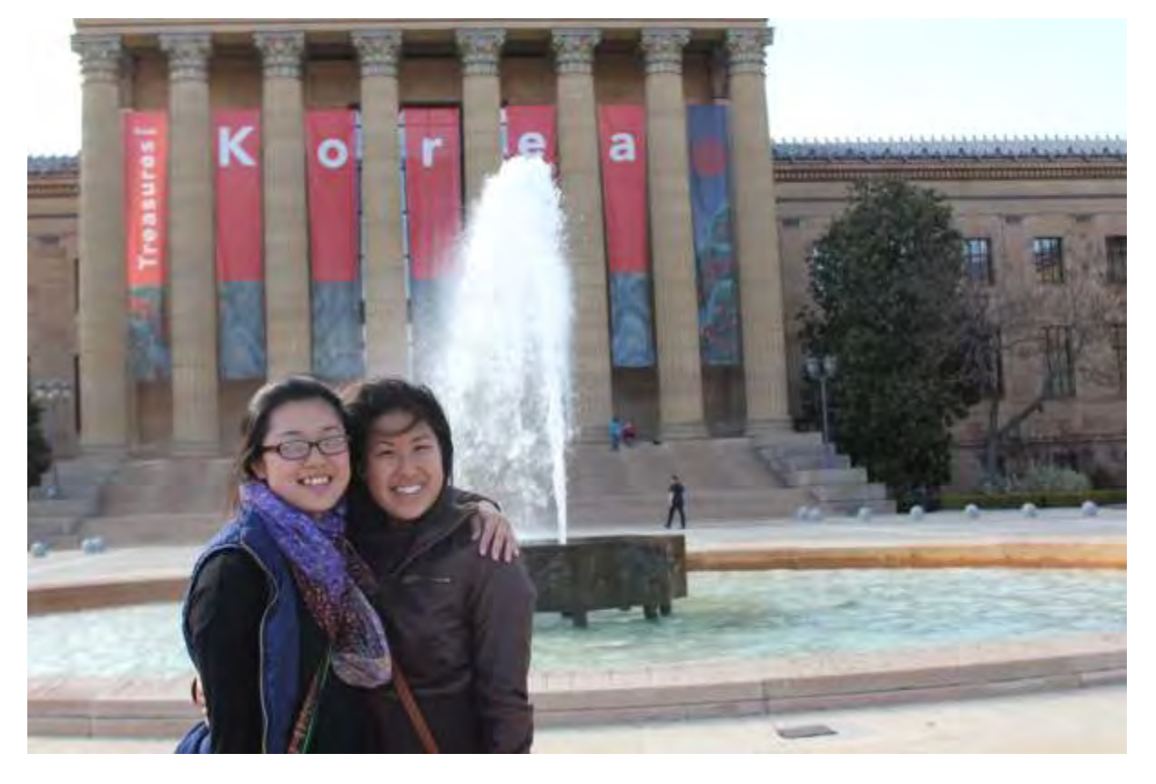
On Wednesday, the Philadelphia Museum of Art had a free night, so we packed the vans and headed over to get to know the city.

So together, we organized a workshop for the youth group, from Friday night to Sunday morning, which included a special banquet night for them to serve their parents. Our theme was "Return the Love", so that the kids could give back to their parents, and so we could give back to our older brothers and sisters who guided us when we were their ages. The dinner ended up being a little clunky and awkward, but the community seemed really happy and a inspired, and the kids had a great experience and were happy to spend time together.