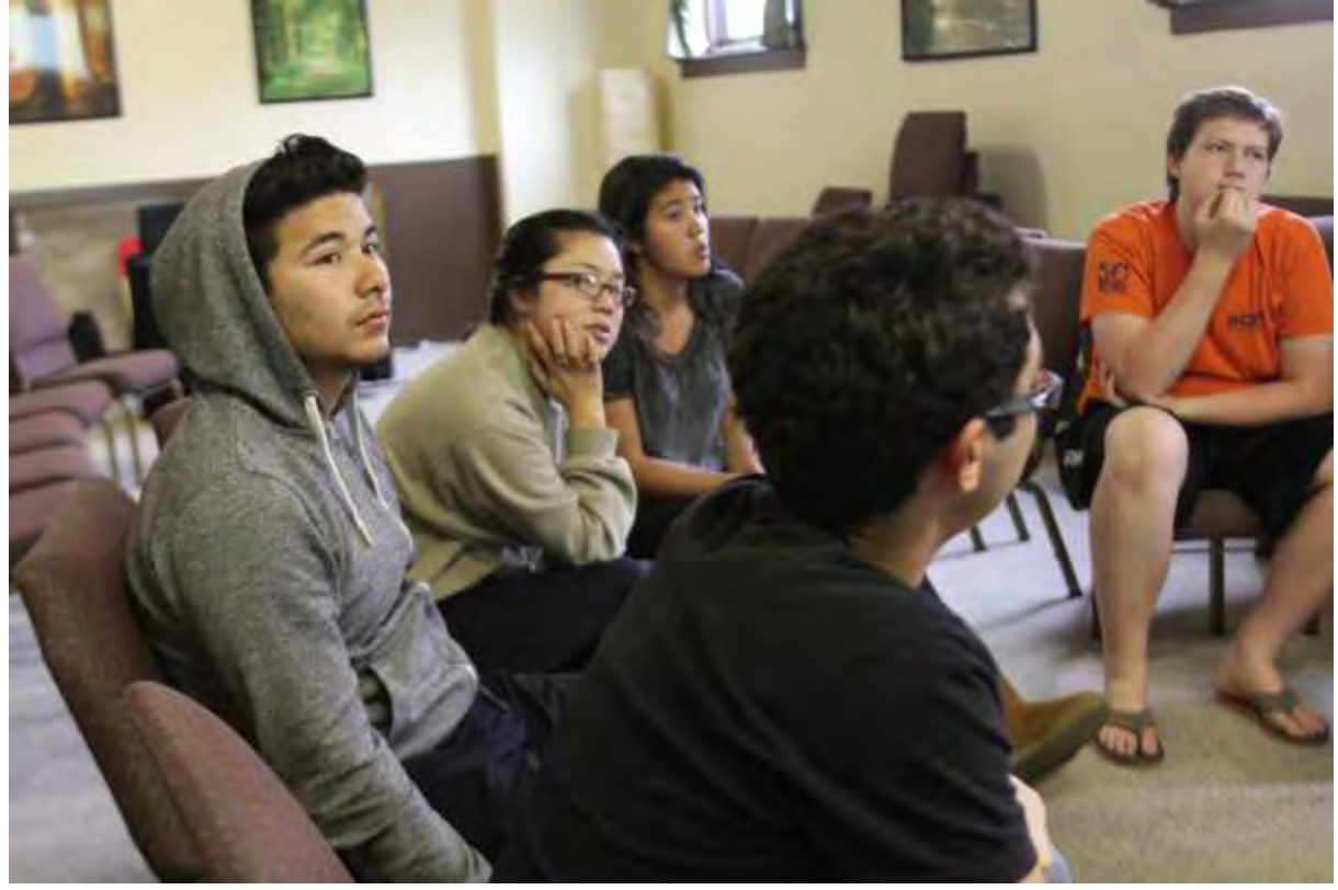
Monday: Our "Hot Topic" debate on the existence of God.