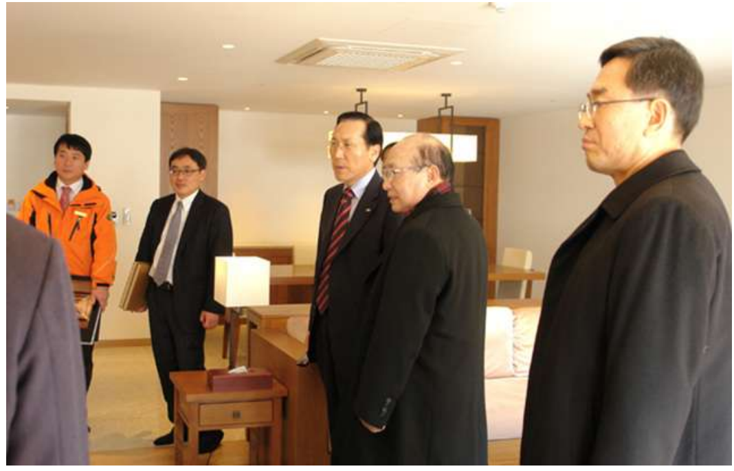
He inspected the newly renovated main building of the Dragon Valley Hotel, and expected them to create more profits and improve guest satisfaction, through friendly, hospitable service and high-quality management.