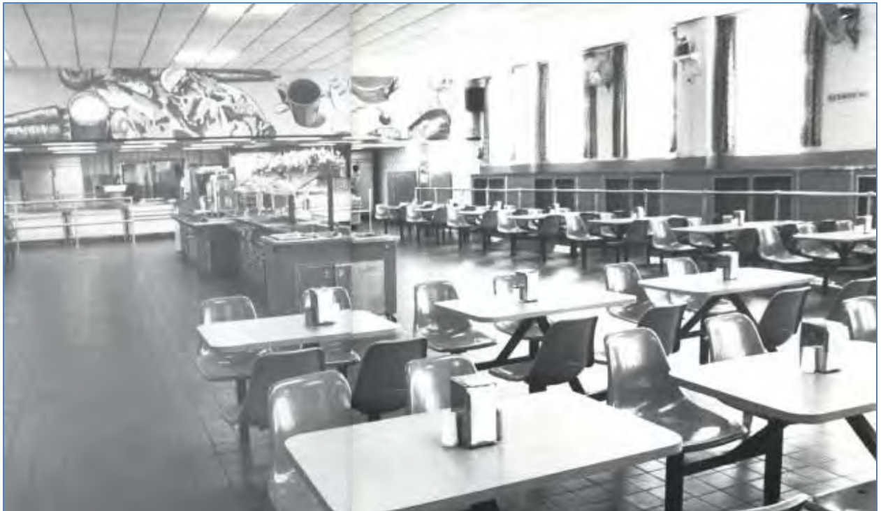
The prison cafeteria. Every morning, Father sets up the salt and pepper shakers and the napkins.

Question: You were asked to make arrangements for visitors who want to meet with Father at Danbury. Can you describe your task there in more detail?