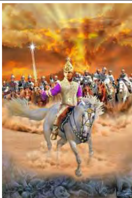
Kalki Avatar by Yuichi Tanabe

... Come ye people all around the world, lets unite into one."