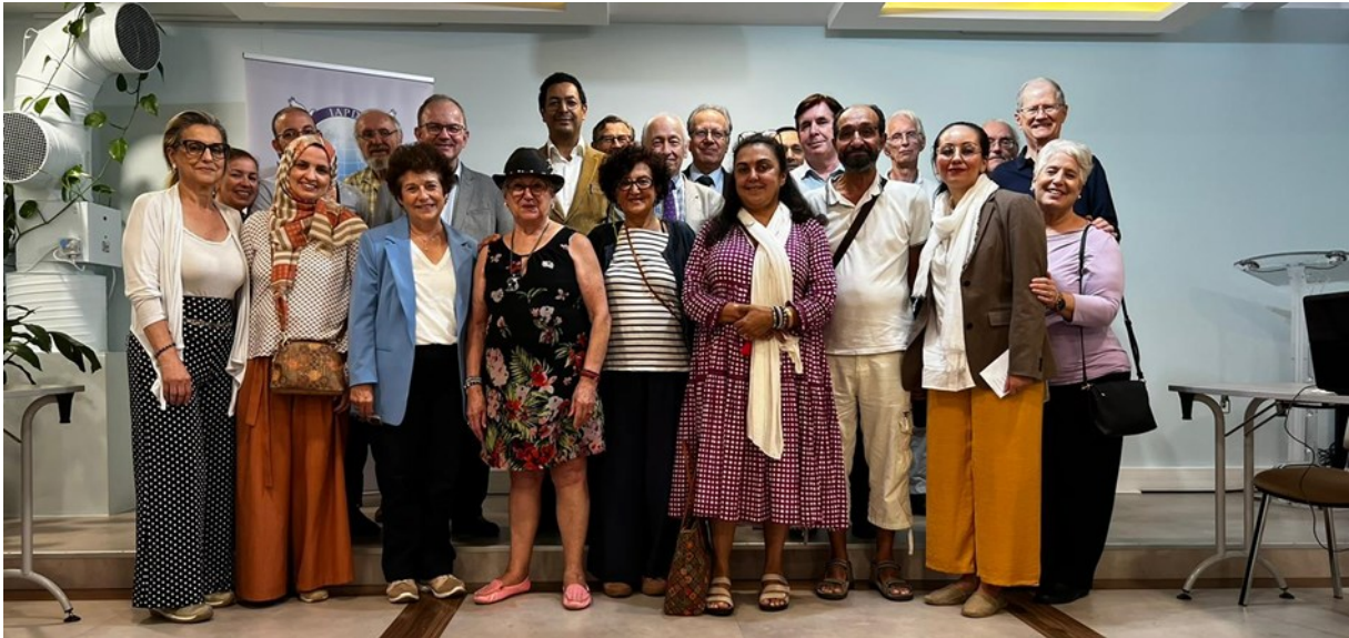
Some of the speakers and participants at Espace Barrault, Paris.