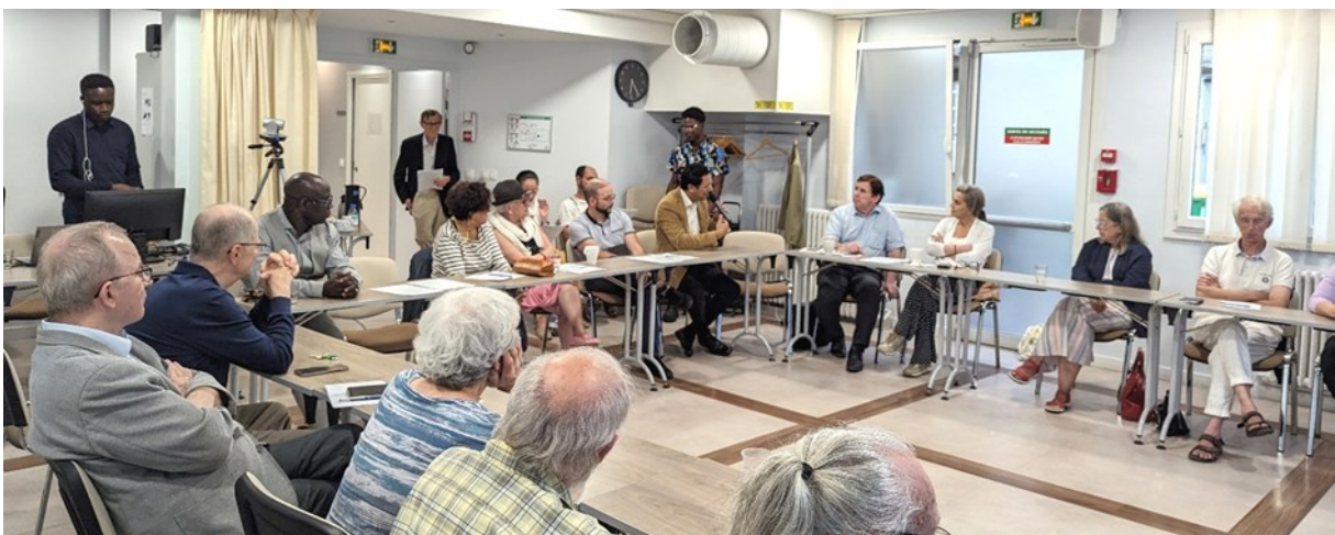
Questions-and-answers session at the Espace Barrault in Paris.