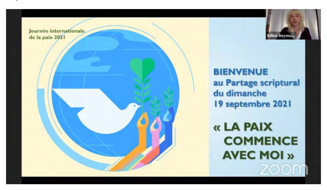
Paris, France -- "Peace Starts with Me" was the theme of the latest interfaith scripture discussion organized by UPF and its Interreligious Association for Peace and Development (IAPD).

Jean-François Moulinet September 19, 2021