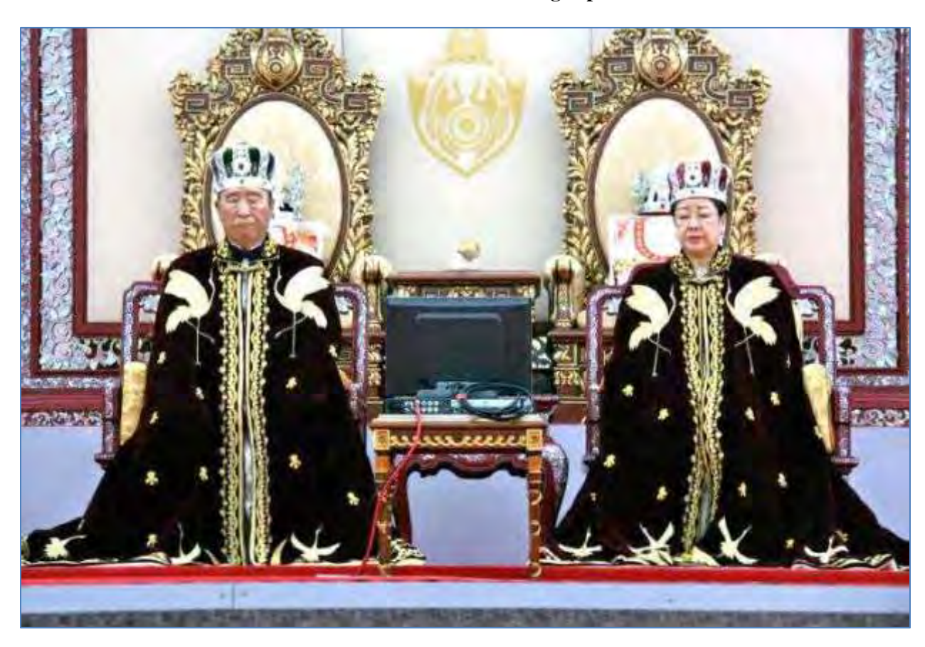
March 27, 1990 Proclamation of True Parents and the Establishment of Kingship

On the occasion of True Parents' Day 1990, True Father declared he had "restored the right of parents" and was "sending out tribal messiahs to put everything in order, just as God sent the returning Lord and just as He sent Jesus." The next step, "restoration of the right of kingship," he said, "remains." In True Father's words: