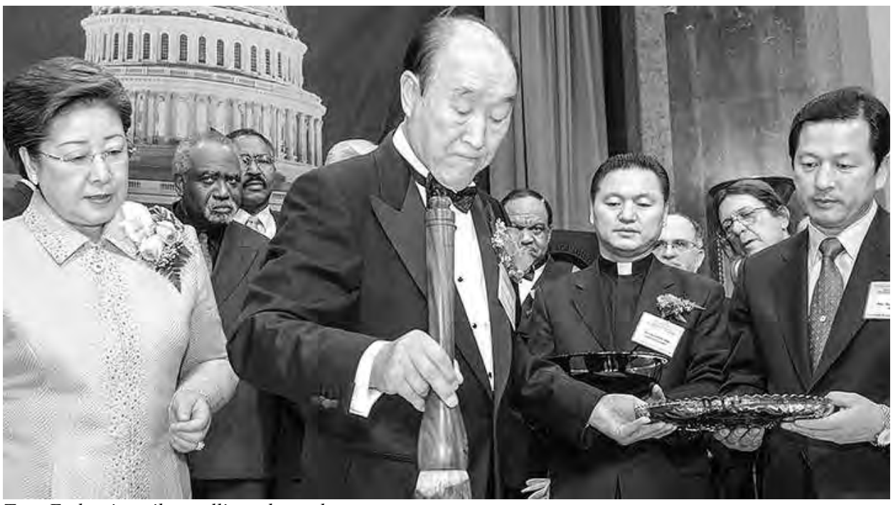
True Father inscribes calligraphy at the ceremony.

The Unification movement conducted six "crown of peace" ceremonies from late 2003 until early 2005. The first of these was the coronation of Jesus as "King of Peace" in Jerusalem as part of the Middle East Peace Initiative on December 22, 2003. Most of the coronations did not generate controversy or significant notice outside of the movement, with the exception of the event at the Dirksen Senate Office Building on March 23, 2004. The program was elaborately prepared. Building on contacts established over the years through The Washington Times, the host committee included six congressional co-chairs and a partial listing of the invitational committee included three additional congressmen, as well as one current and one retired U.S. senator, four state senators, a former ambassador. Ninety-one Ambassador for Peace awardees represented all 50 states. There was a reconciliation ceremony between the three Abrahamic faiths, and one representative each from Jewish, Islamic and Christian traditions were given