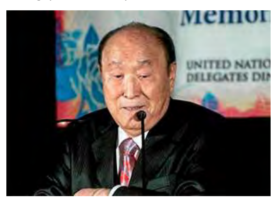
March 18, 2010 First Legacy of Peace Ceremony