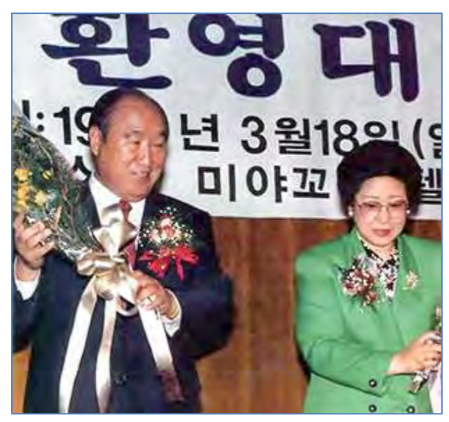
True Parents receive flowers at the San Francisco public speech to the Korean community on March 18, 1990

True Father Begins Speaking Tour of U.S. Korean Communities