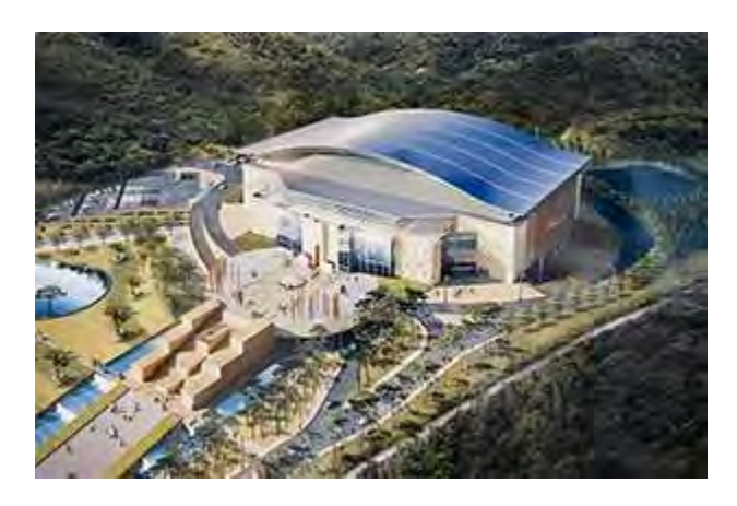
March 22, 2012 Cheongshim World Peace Center Dedicated

Cheongshim World Peace Center, a massive arena designed to hold 25,000 people near the Unification movement's Cheongpyeong Heaven and Earth Training Center, opened on the 53rd True Parent's Day, March 22, 2012. This completed construction of the largest and most sophisticated multipurpose cultural center in South Korea, eight times larger than the Sejong Performing Arts Center and twice as large as the Olympic Gymnastics Hall. The highlight of the dedication was a performance of the "Crown of Glory," a musical based on the life of True Parents. Performed by 60 actresses and actors with support of 150 staff and 60 orchestra performers, the script was developed with help from the research team from Cheong Shim Graduate School of Theology. A mammoth moving and rotating stage with 3D video supported the production. However, True Father emphasized the importance of the arena as a Blessing venue. He noted, "From now, we don't have to use the Seoul Olympic Stadium; but can use this place to give birth to hundreds of thousands of blessed families here."