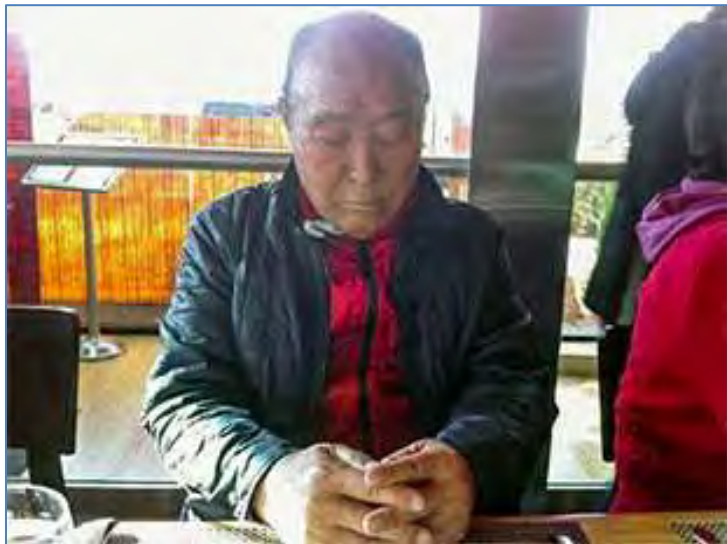
True Father in Las Vegas, praying for the safety of Japan after the earthquake

A 9.0 magnitude undersea earthquake approximately 43.5 miles off the Japanese coastline on March 11, 2011, triggered a powerful tsunami, with waves reaching heights of up to 133 feet, which, in the area of the city of Sendai, traveled up to 6 miles inland. Referred to in Japan as the Great East Japan Earthquake, it was the most powerful earthquake ever recorded to have hit Japan, and the fourth most powerful earthquake in the world since modern record-keeping began in 1900. The earthquake moved Honshu (the main island of Japan) 8 feet eastward and shifted the Earth on its axis by between 4 and 10 inches. A Japanese National Police Agency report confirmed 15,889 deaths, 6,152 injured, and 2,601 people missing across twenty prefectures, as well as 127,290 buildings totally collapsed, with a further 272,788 buildings "half collapsed" and another 747,989 buildings partially damaged. The tsunami caused level 7 nuclear meltdowns at three reactors in the Fukushima Daiichi Nuclear Power Plant complex, affecting hundreds of thousands of residents in an 18-mile radius who were forced to evacuate. The World Bank's estimated economic cost was US $235 billion, making it the costliest natural disaster in world history.