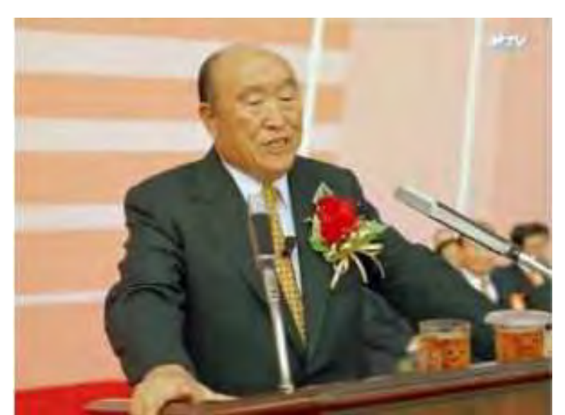
The North Korea–South Korea Unification Rally was held in the Main Olympic Stadium in Jamsil, Seoul, on March 12, 2000

Held on the foundation of similar events held to commemorate True Father's 80th birthday in 20 Korean cities, it was a national-level event attended by around 120,000 people. In his speech, titled "The Path of Life That Needs to be Trod by God's Princes and Princesses," he proclaimed the age of the brotherhood of humankind.