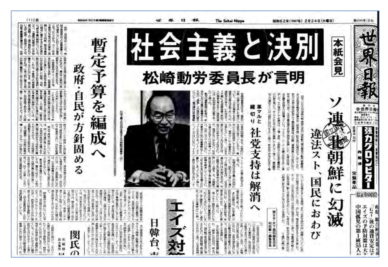
January 1, 1975 Sekai Nippo Established

Sekai Nippo, a Tokyo-based daily newspaper, began publication on January 1, 1975. Its name translates as "The World Daily," and one of its main foci has been foreign news sent by overseas correspondents, many of whom also served as Unification movement missionaries. In 2004, Sekai Nippo, in cooperation with NewsStand Inc. of Austin, Texas, announced its availability as the first Japanese newspaper offered in a digital format that maintained the exact layout of the print edition. It continues as one of the Unification movement's constellations of news outlets.