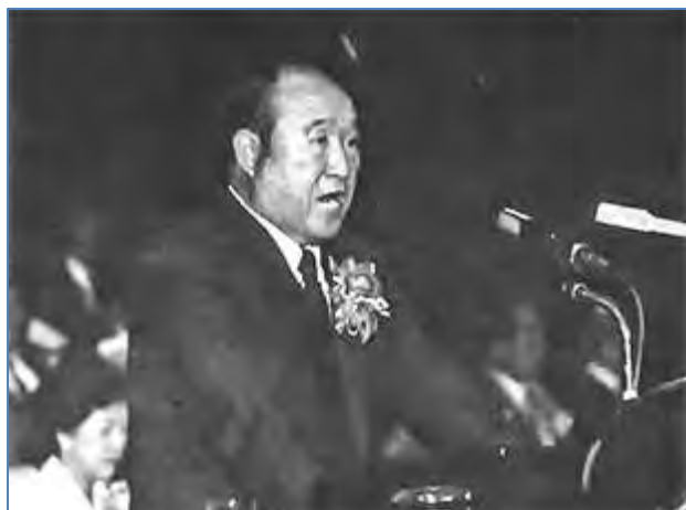
True Father delivers the Citizens' Federation Founder's Address

True Father Returns to Korea after Danbury