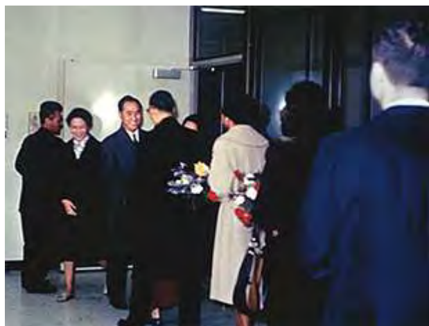
True Parents at the Los Angeles airport