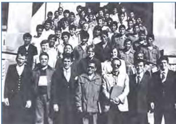
Shortly after its launch, CAUSA holds a workshop for students in Bolivia