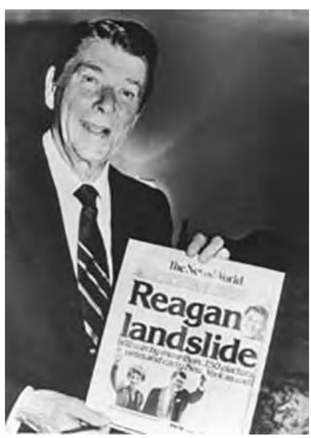
Ronald Reagan holding a copy of the News World, which predicted Reagan's landslide victory on Election Day morning, November 4, 1980.

After the Washington Monument rally of September 1976, True Father "set the deadline" of December 31 for producing the first issue of a new daily newspaper in New York City. On December 31, "the presses rolled early in the morning ... and the first issue of The News World hit the streets of New York." With a color photograph on the front page and a motto that described it as "New York's oldest daily color newspaper," The News World was a 24-page general-interest daily with a staff of 200. During the New York City blackout of July 1977, it was the only newspaper to publish, with reporters working by candlelight to write and edit stories. Later, during a three-month newspaper strike that shut down the city's other major dailies, The News World continued to publish, with its circulation soaring to nearly 400,000 daily.