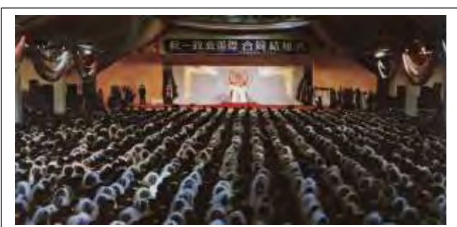
The 6,500 Couple's Holy Marriage Blessing Ceremony, October 30, 1988

On October 30, 1988, True Parents blessed in marriage 6, 516 couples in a Holy Marriage Blessing Ceremony conducted in the complex of Ilhwa Pharmaceutical's McCol soft drink factory in Yong-in, Korea. This Marriage Blessing was significant in that it brought together some 2,500 Korean/Japanese couples. As True Father noted, "Korea and Japan have been enemies for a long time, and their animosity has never been healed. Through this matching ... emotional strains and hurt will be removed ... the fortunes of these two nations will begin to take root on