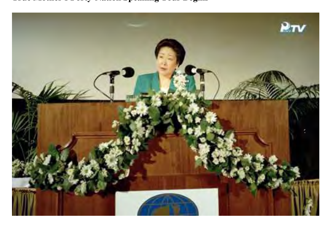
November 2, 1993 True Mother's Forty-Nation Speaking Tour Begins

On November 2, 1993, True Mother set off on her "True Parents and the Completed Testament Age" tour of forty nations. True Mother first spoke in Frankfurt, Germany. She called on women to take the lead in realizing God's ideal. Her speaking tour ended in Taiwan on December 22, 1993. True Mother with True Father previously delivered the address in 33 U.S. cities, and True Mother gave it in the U.S. Capitol. She later delivered the address at the United Nations in New York on September 7, 1993, which served as a springboard to the world tour. From September 11 to 30, True Mother conducted twenty-five rallies in Japan, the highlight being her speech before 50,000 people at the Tokyo Dome. In October 1993, she delivered the Completed Testament Age message before audiences at forty Korean universities, often speaking at two campuses on the same day. Having spoken in the United States, Japan and Korea, True