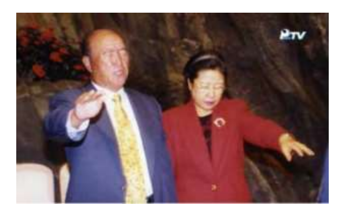
October 23, 1999 Declaration of the Day of Liberation of the Blessing for the Entire Cosmos

On October 23, 1999, the Declaration of the Day of Liberation of the Blessing for the Entire Cosmos was held in East Garden, beginning at 7:00 a.m. In attendance were the children of True Parents and around forty movement leaders. On this day True Father said, "As of today, I proclaim the unity of the four great realms of the heart, the liberation of creation, the liberation of children, the liberation of a couple and the liberated realm of the True Parents of Heaven and Earth." Based on this victorious foundation, True Father said we had entered the era of the realm of absolute ownership in which God can freely act. It was at this declaration that True Father instructed that holy wine and pure love candy be distributed to people on the street. (Materials provided by the FFWPU History Compilation Committee)