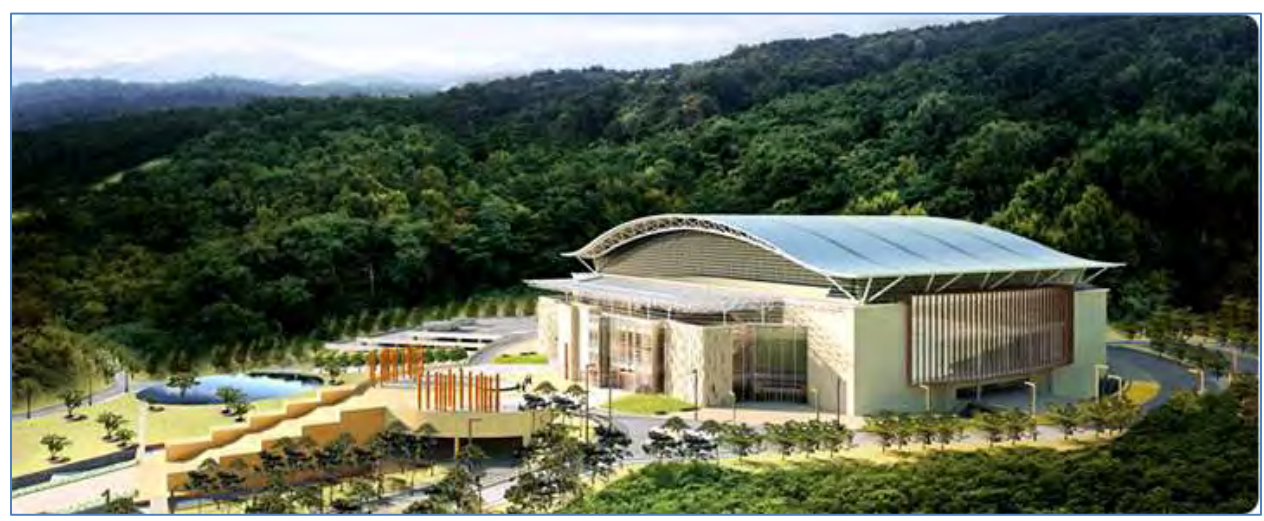
Design plans for the Cheongshim Peace World Center

Three thousand people attended the groundbreaking ceremonies for the Cheongshim Peace World Center on October 28, 2008. Designed to hold 25,000 people, it was created to be the largest and most sophisticated multipurpose cultural center in South Korea, eight times larger than the Sejong Center for the Performing Arts and twice as large as the Olympic Gymnastics Hall, both located in Seoul. With three floors underground and four floors above, it was designed to be the first Korean arena with folding chairs, a state-of-the-art moving stage and an audiovisual system to host an array of events including concerts, business conventions, corporate events, indoor sports competitions, educational events, expositions and television commercials. The arena would take three years to complete and addressed True Father's longheld desire to see an iconic center for global culture near Chung Pyung Lake.