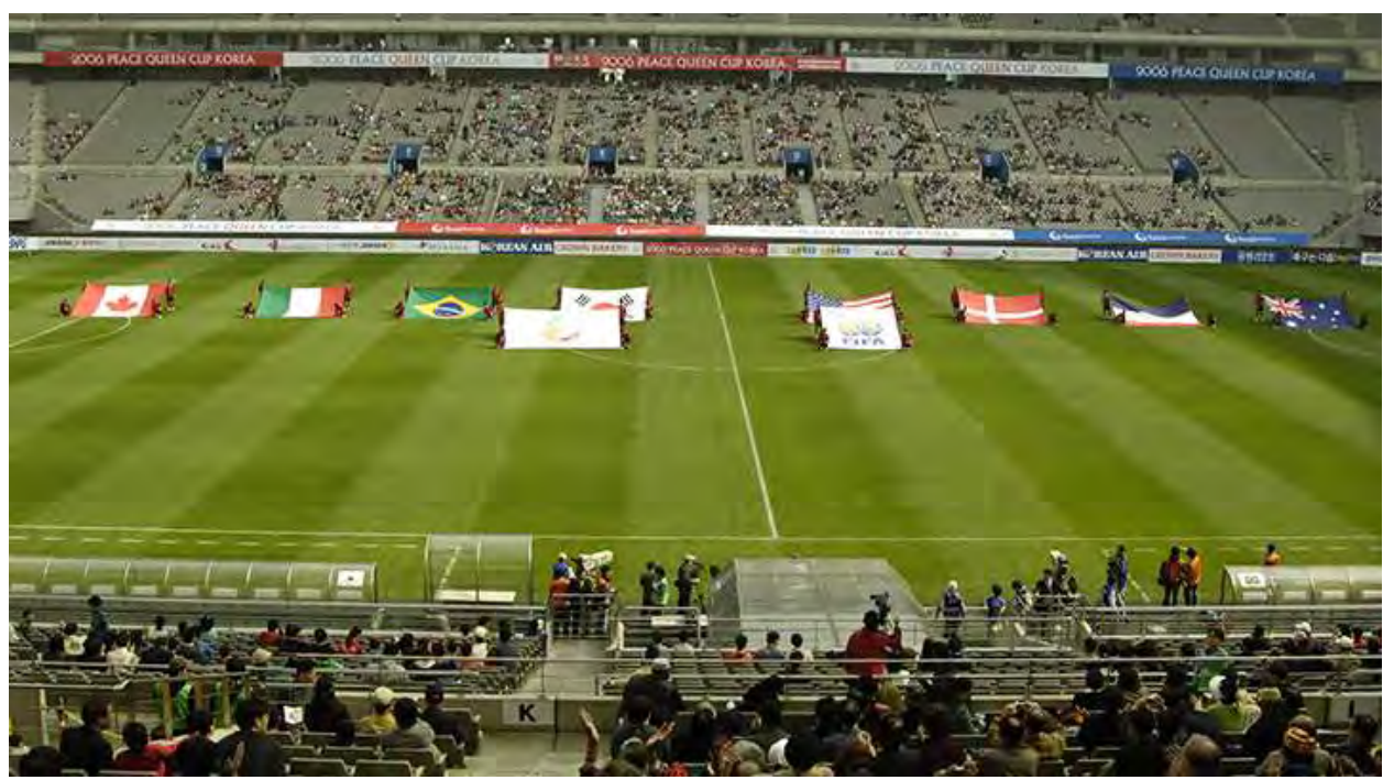
The Inaugural Peace Queen Cup Tournament is held in South Korea

Following the 2002 World Cup soccer tournament jointly sponsored by Korea and Japan, True Father established the Sun Moon Peace Football Foundation. It sponsored a Peace Cup invitational soccer