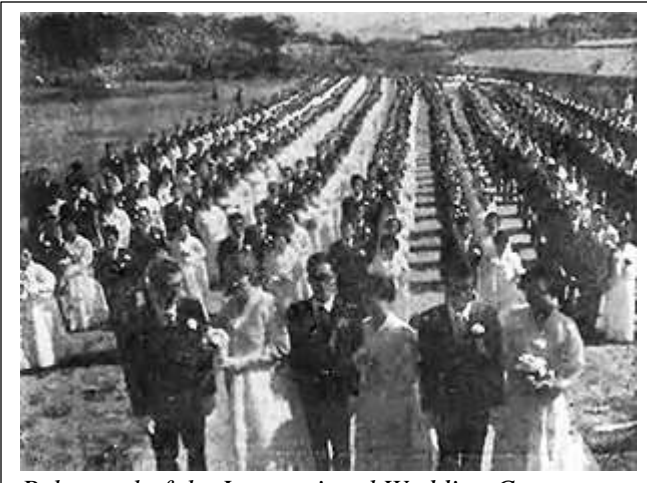
Rehearsal of the International Wedding Ceremony of 777 couples at Sutaek Ri

True Parents presided over the first truly international Marriage Blessing Ceremony when they blessed 777 couples on October 21, 1970. As part of the 430 Couples Holy Marriage Blessing in 1968, True Parents blessed 43 non-Korean couples overseas in 1969. For the 777 Couples Holy Marriage Blessing, participants came from 10 nations to Korea. The Marriage Blessing was conducted at Seoul's Changchung (Metropolitan) Gymnasium in the presence of over 15,000. True Father stated that this was the last Marriage Blessing that he would conduct "before globalizing my mission." He noted that the 777 Couples Holy Marriage Blessing was the seventh following True Parents' Holy Wedding. This Marriage Blessing lay the