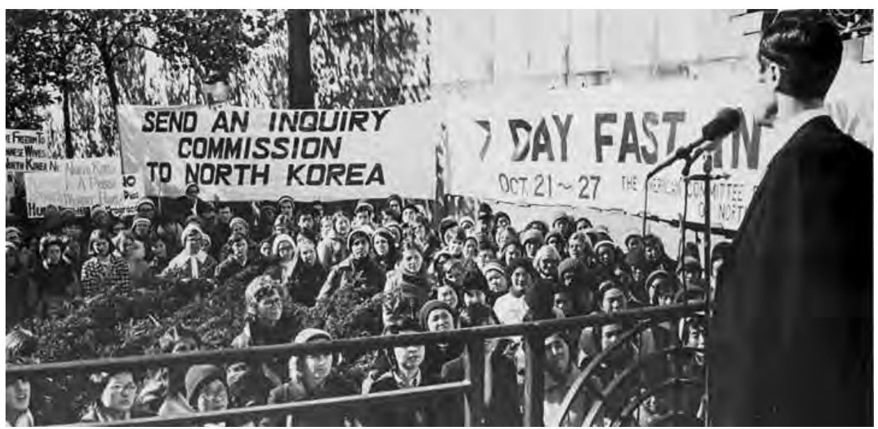
Protestors hold a 7-day fast on behalf of wives in North Korea

7-Day Fast for Japanese Wives of North Korean Repatriates