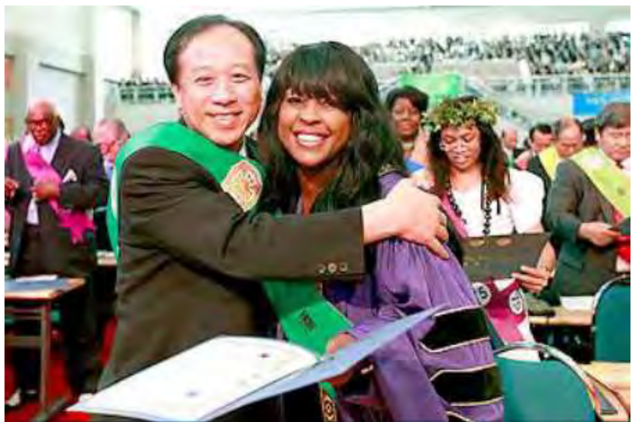
Ministers of different faiths and backgrounds embrace after receiving honorary Korean surnames

True Parents conducted a grand ceremony in the Cheongshim Peace World Center for the bestowal of Korean surnames upon 172 ministers, 43 each from the North, South, East and West quadrants of the United States. They came to Korea representing America, Christendom and the entire world, with the purpose of registering in God's Kingdom and testifying that God had anointed True Father. The clergy, who understood and supported True Parents' historic mission from the point of view of 77 different religious denominations, were united through a singular cause. By joining into and becoming part of a Korean family and exchanging names, they gave a powerful testimony to the Korean people of the fruits of True Parents' work to remove all barriers between races and denominations. Through proclaiming that Korea is God's Homeland and Hometown, they affirmed that God had chosen this nation to be the base for the Kingdom of God and the family culture that honors elders and has fidelity and faithfulness in every aspect of the family -- from marriage to the filial piety of children to their parents.