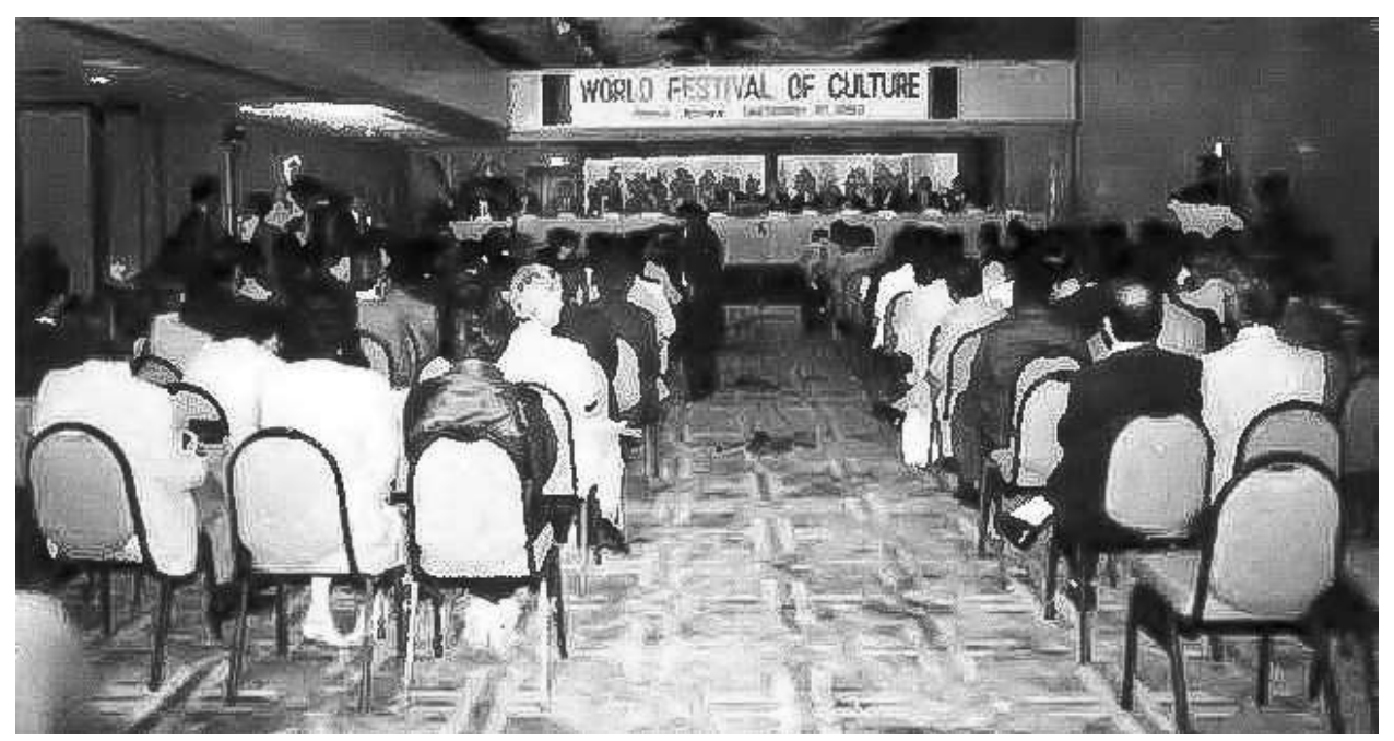
The press conference announcing the World Festival of Culture

On September 14, 1999, True Father opened the era in which blessed families were no longer to pray in the name of True Parents or any mediator but in their own names as blessed couples who have inherited True Parents' realm of victory. True Father explained that this was meant to mark the era of "personal responsibility." He said that couples should "report their work" and that it was no longer "a time to pray to receive blessings." This guidance was consistent with True Father's view that humankind had entered the Completed Testament Age.