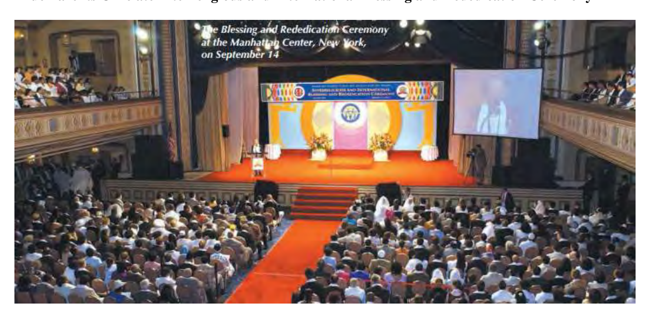
September 14, 2002 True Parents Officiate Interreligious and International Blessing and Rededication Ceremony

True Parents officiated four major Marriage Blessing Ceremonies in 2002, all in the United States. On April 27, they officiated the 144,000 Clergy Couple Blessing, the main venue of which was the Sheraton National Hotel in Arlington, Virginia. On July 3, they officiated the 1.44 million Second Generation Christian Youth and World Religious Youth Blessing from the same main venue. Then on September 14, 2002, they officiated the Interreligious and International Blessing and Rededication Ceremony. This historic Blessing ceremony was held in New York City's Manhattan Center, just a few short miles from