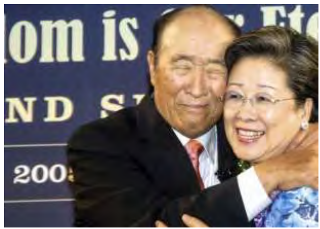
True Parents at the inauguration of the Universal Peace Federation on September 12, 2005

True Father established the Universal Peace Federation (UPF) on September 12, 2005, prior to the United Nations' 60th anniversary. Its inaugural convocation was held before 376 delegates from 157 nations at Lincoln Center's Alice Tully Hall in New York. Its mission, True Father declared, was "to renew the existing United Nations and provide a new level of leadership as an 'Abel-type' United Nations." As part of the launch, he also proposed a "World Peace King Bridge Tunnel" to "build a passage for transport across the Bering Strait." He described this as "a truly providential and revolutionary project" and envisioned it as a crucial "link" in "an international highway system connecting the world as a single community." UPF was a successor organization to the Interreligious and International Federation for World Peace (IIFWP, established in 1999). In addition to its UN renewal and Bering Strait initiatives, UPF led the movement's Middle East Peace Initiative (MEPI), which sponsored interfaith "Pilgrimages for Peace," and its Northeast Asia Peace Initiative (NEAPI), which supported Korean unification.