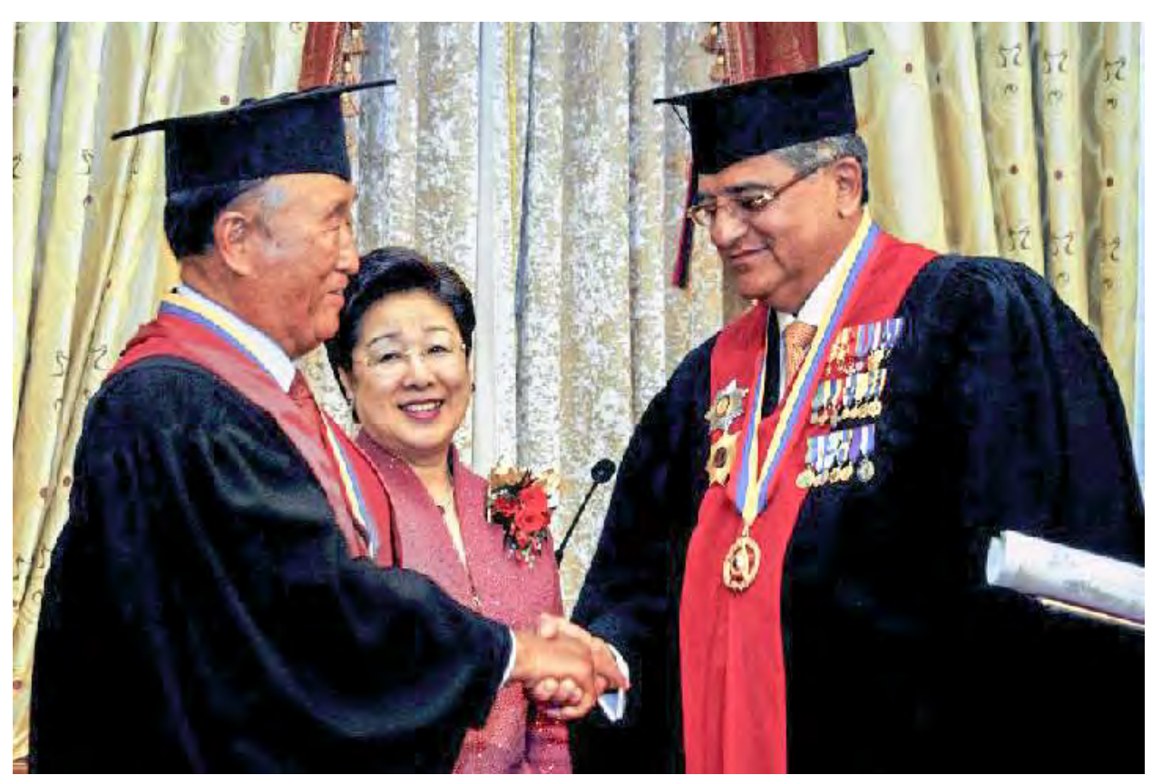
True Father receives an honorary doctorate from the University of Bridgeport September 7, 1995.