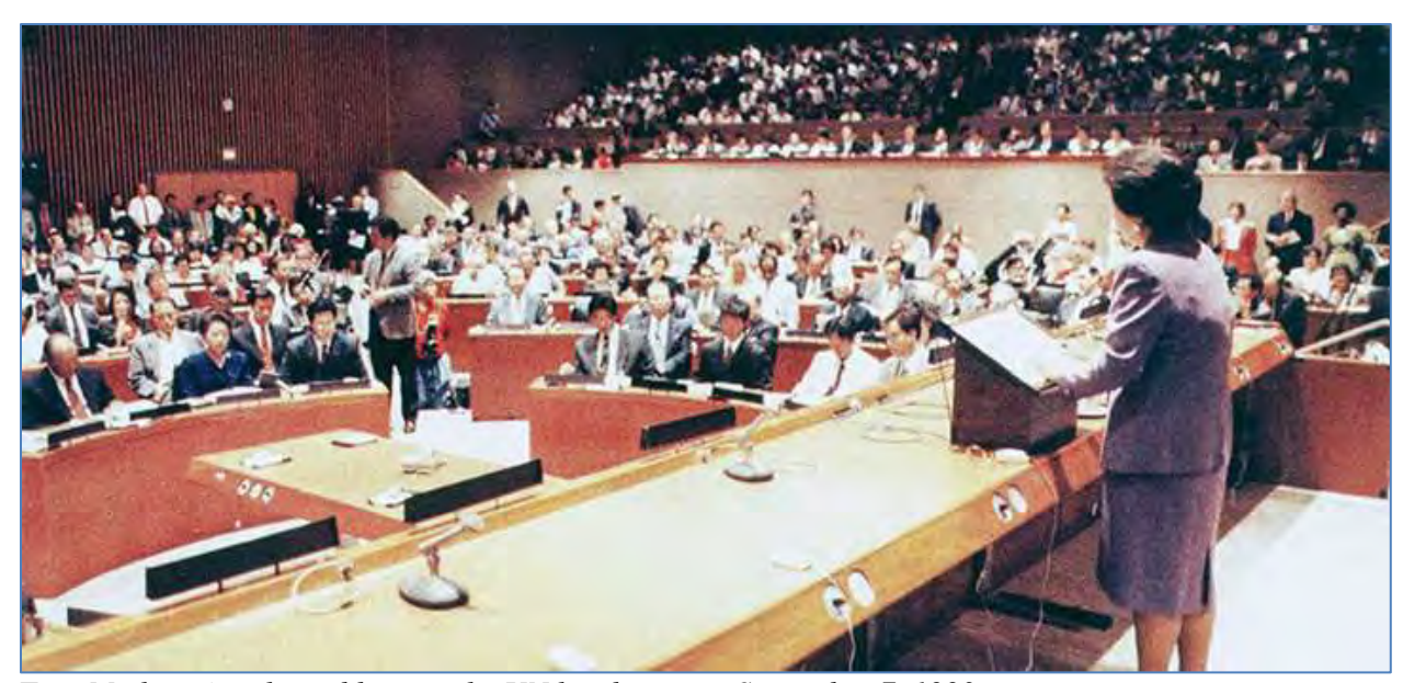
True Mother gives her address at the UN headquarters September 7, 1993.