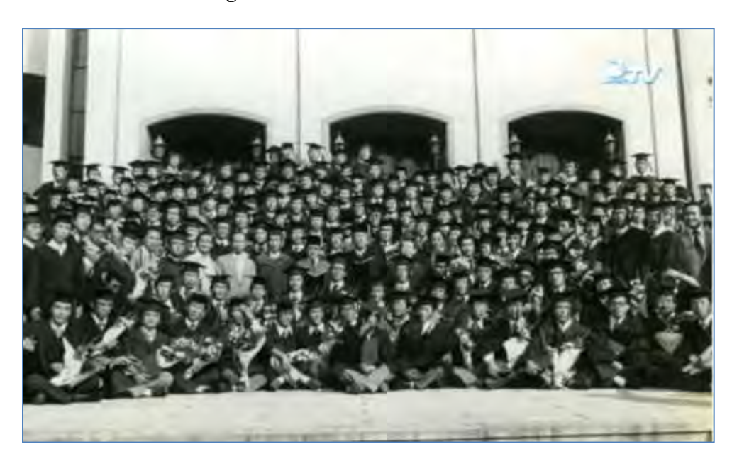
September 4, 1979 The Unification Theological School's First Graduation

On September 4, 1979, the Unification Theological School held its first graduation at the old church headquarters in Seoul. Around 600 people attended, and two students from the Department of Theology and 174 students from the Department of Divinity graduated. At this ceremony, the principal of the school encouraged the graduates to be shepherds that do not neglect to further explore the truth. The Unification Theology School is the birthplace for young pastors who then go on to study at the Sun Moon University Theological Department.