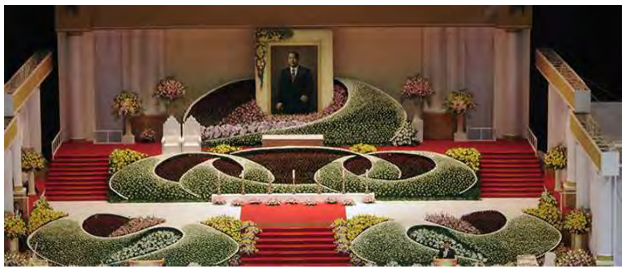
True Father ascended to the spirit world on September 3, 2012 and his Seonghwa (ascension) ceremony was held in Korea.

September 3, 2012 True Father's Ascension