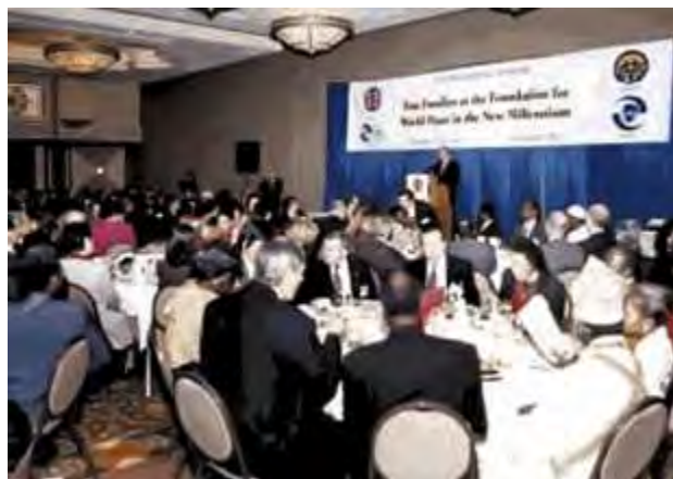
A Hoon Dok Hae conference is held in Washington D.C. in 1999

On September 1, 1997, True Father proclaimed a "New Start." He began a tradition where all Unificationist families set aside one hour each morning from 6:00 to 7:00 to recite the Family Pledge (the core pledge of Unificationists), and then hold a daily study and discussion of his words. On October 13, 1997, True Father named the daily morning reading tradition Hoon Dok Hae, which was understood to be a "gathering for reading and learning." In addition to being a cornerstone of morning devotions, the church sponsored Hoon Dok Hae conferences for civic and religious leaders that focused on "reading and learning" True Father's words. True Father's words would later become the basis for the Cheon Seong Gyeong (2004) or "Heavenly Scripture."