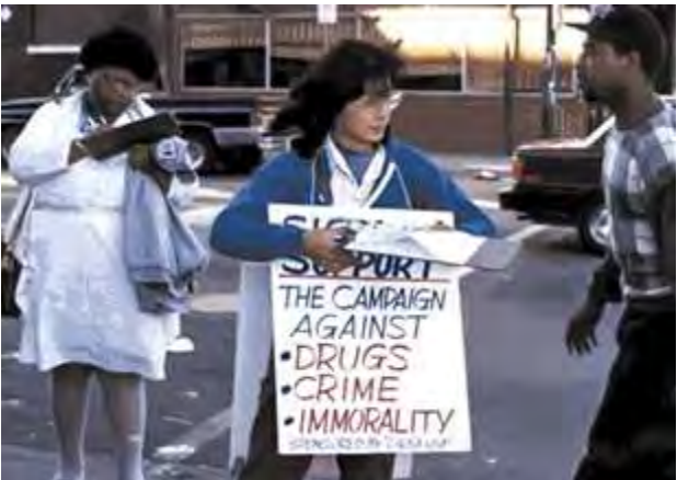
A woman collects signatures for CAUSA USA

True Father planned to conduct a Moscow rally by 1981, but this was prolonged for nearly a decade due