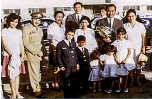
True Father visits Jordan prior to crossing over to Israel during his first World Tour