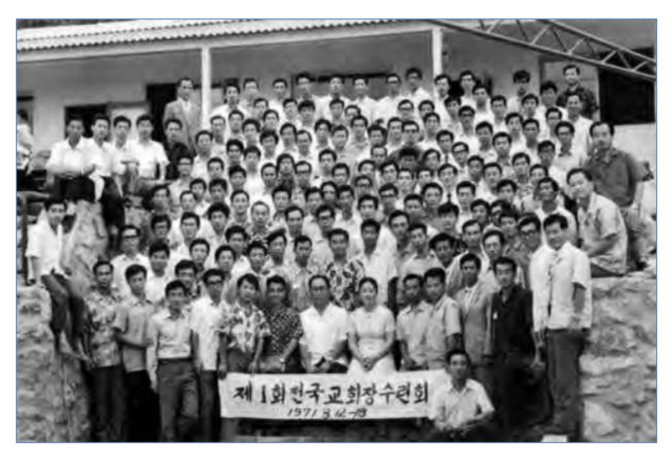
August 12, 1971 The First National Workshop for Pastors

The first national workshop for pastors was held for eighteen days beginning August 12, 1971, at the Chung Pyung Training Center. This workshop was held within a month after the completion of the training center, and all participating pastors felt proud that a place of education and training had been created. During the workshop True Father declared his vision that the training center would become the beginning point of missions around the world and that it would become an international holy ground. Today, with Cheon Jeong Gung having been built there, Chung Pyung has become a hometown of the heart to all members around the world as True Father had said.