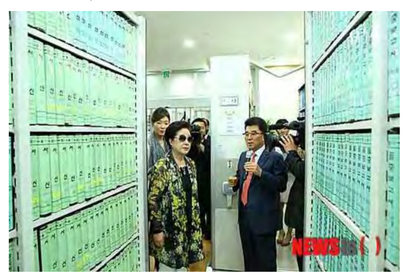
August 8, 2014 Dedication Ceremony for True Parents' Archives