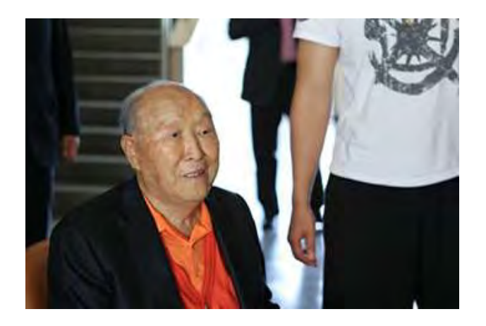
August 13, 2012 True Father's Final Prayer

Though he is very ill, True Father takes time to visit the Cheongshim Middle and High School, Chung Pyung World Peace Center and the Chung Pyung Training Center.