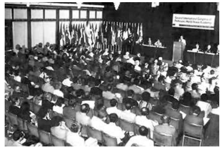
The Second International Conference of the Professors World Peace Academy (PWPA), scheduled for August 13 to 17, convened under the title "The Fall of the Soviet Empire."

Despite its declining, even exhausted economy, in 1985 the Soviet Union still appeared as formidable as ever. At that time, True Father insisted that the Second International Conference of the Professors World Peace Academy (PWPA), scheduled for August 13 to 17, be convened under the title "The Fall of the Soviet Empire." Several prominent professors struggled with the title, considering it too extreme, but True Father refused to relent. During the conference, over 150 "Sovietology" experts and 100 international scholars presented 80 papers which resulted in four books. In the end, the conference was prophetic. Within a few years the Soviet Union began to crumble. One scholar, writing several years later in The