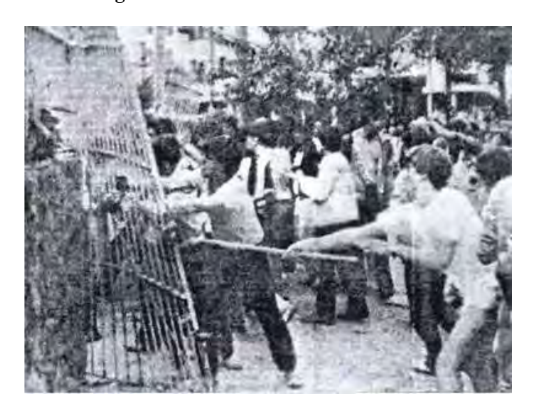
August 10, 1981 Violence against Unification Church Centers in Brazil

1981 is remembered in the Brazilian Church as the year of the "great persecution." Violence against the church included the stoning or sacking of fourteen centers and burning of six more, five of which were completely destroyed. The riots were triggered by a series of media attacks against the church over four successive Sundays on the Globo Television Network's "Fantastico," a show with one of the largest audiences in Brazil. Prior to the outbreak the Brazilian Church had experienced remarkable growth with a network of sixty-four centers throughout the country. During and following the attacks, hundreds of home church families sheltered members and became more committed to the Church. The destruction stimulated the Brazilian Church to later purchase an impressive headquarters church in Sao Paulo from which to coordinate its work.