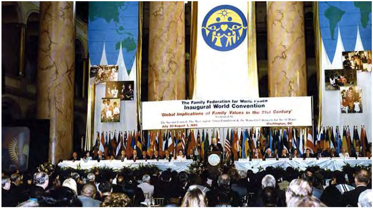
The inauguration of the Family Federation for World Peace and Unification took place in Washington, D.C.

Establishment of the Family Federation for World Peace