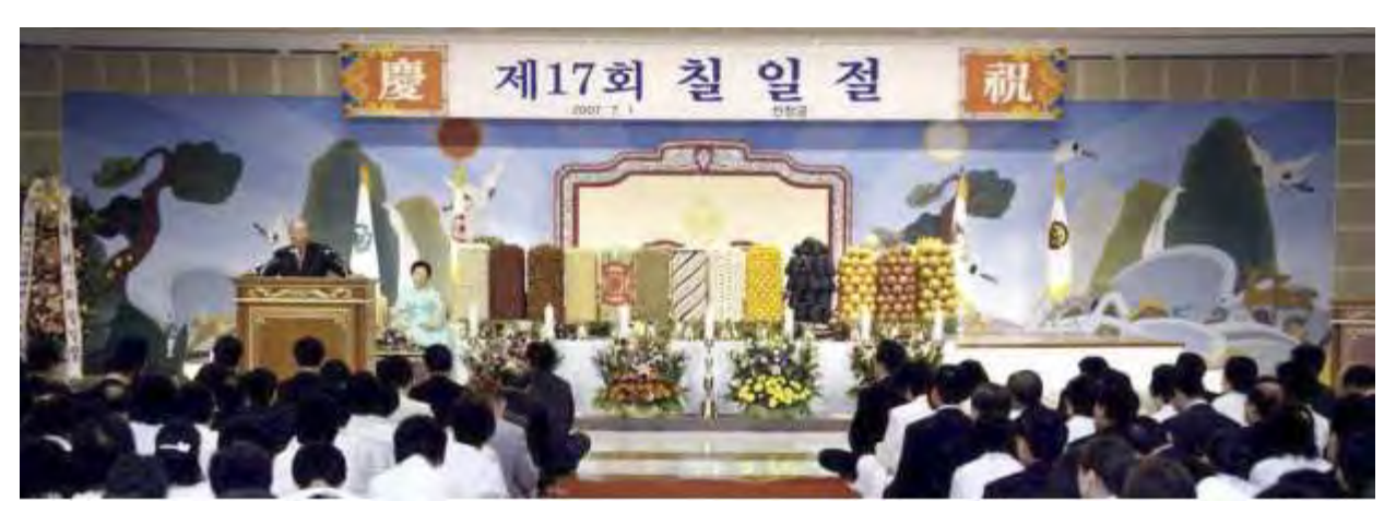
July 1, 1991 Declaration Day of God's Eternal Blessing

True Father proclaimed the Declaration Day of God's Eternal Blessing (Chil II Jeol) at a special ceremony