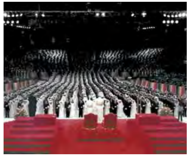
July 1, 1982 Holy Blessing of 2,075 Couples in Madison Square Garden

We celebrate 37 years since a large percentage of American Unificationists participated in a recordsetting Marriage Blessing of 2,075 Couples officiated by True Parents at Madison Square Garden. This number eclipsed the previous record of 1,800 couples wed by True Parents in 1975, which the Guinness World Records reference book recorded as the largest mass wedding in history. Engagement ceremonies of 705 couples in May 1979, 843 couples in December 1980 and 653 couples in June 1982 led up to the ceremony. More than 60 percent of the couples were either interracial or cross-cultural. With this event, the U.S. church demographics went from primarily single people to mostly married people virtually overnight.