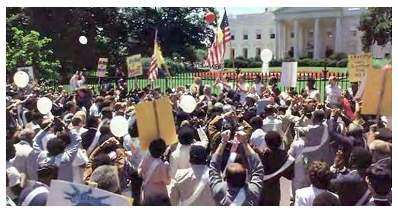
The Rally for Justice and Religious Freedom took place on June 25, 1985.