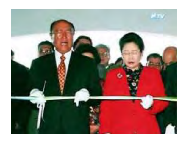
July 1, 1998 Dedication Ceremony of the Education Center for Ideal Families and World Peace

On July 1, 1998, beginning at 10 a.m., a dedication ceremony was held in Jardim, Brazil, for the Education Center for Ideal Families and World Peace. Around 3,000 people, well-known figures in Brazil and leaders from a variety of backgrounds in Jardim, came to the event. True Father said, "The goal of the Jardim education center is to raise people who do not live for their own individual benefit but instead live for the country, the world and God as families and to raise people who live for the world, even though it means sacrificing one's clan or nation." After the dedication, FFWPU members from across the globe began to attend the Jardim forty-day workshops in this center to inherit True Parents' heart and traditions. (Materials provided by the FFWPU History Compilation Committee.)