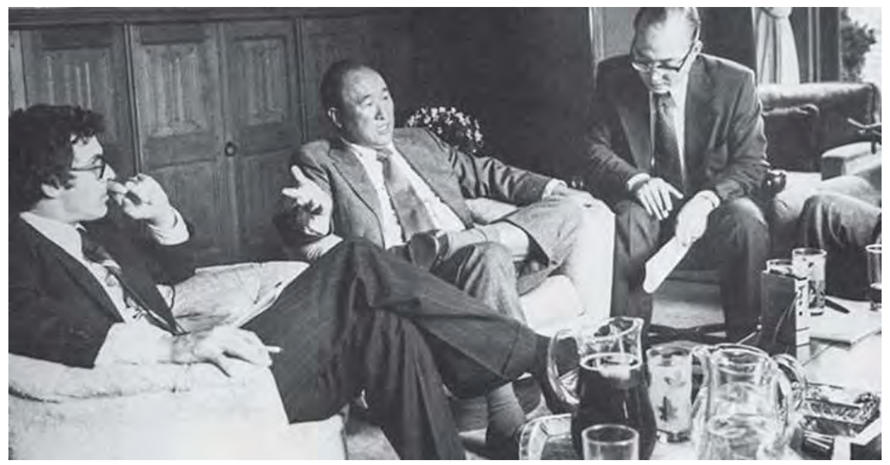
True Father being interviewed for the Newsweek magazine article

True Father granted an interview to Newsweek International's executive and general editors. Excerpts from their <u>three-hour conversation</u> were published as part of a cover story on the Unification Church.