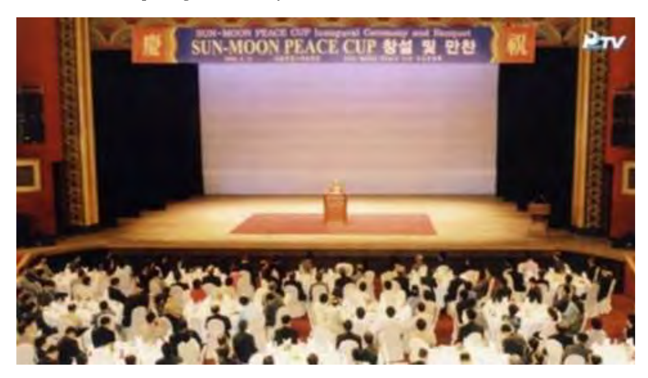
June 12, 2002 Sun Moon Peace Cup Inaugural Ceremony

The Sun Moon Peace Cup Inaugural Ceremony took place at 3 p.m. on June 12, 2002, at the Little Angels Arts Center in Seoul. More than 500 domestic and foreign attendees showed their interest as True Father spoke on seeking "the path to realize world peace through sports." He said that the best soccer club teams in the world would participate in the Sun Moon Peace Cup and that it would "become a festival which hopes for all humankind to become one big family."