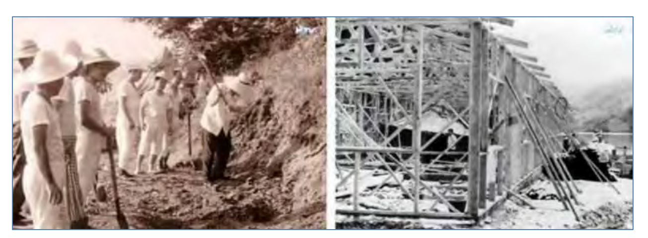
June 17, 1971 Building the Chung Pyung Training Center

Construction work to build the Chung Pyung Training Center in Song-san Hamlet, Seorak Village, Gapyeong County, Gyeonggi Province, began with True Father's first dig at the riverside using a pickax on June 17, 1971. The 30 or so members who were attending a workshop at Sutaek-ri Training Center in the city of Guri to become pastors were all mobilized to help with the construction work. Today, forty-five years after it was erected on land that used to be a mulberry field, Chung Pyung Training Center has become a global holy ground which Unificationists from different nations enjoy visiting. (Materials provided by the Family Federation for World Peace and Unification (FFWPU) History Compilation Committee)