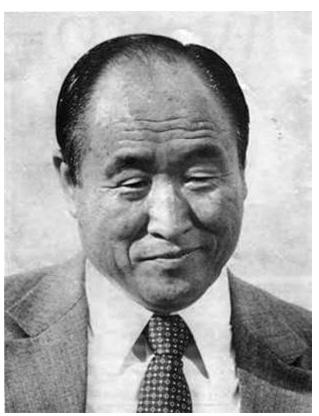
April 16, 1980 True Father Declares the End of the First 21-Year Course

Unification theology teaches that the course of creation and restoration unfolds according to the three stages of formation, growth and perfection. True Father applied that principle in conducting his ministry. He initially applied it to his individual course upon embarking on his public ministry after World War II. The 21-year course with which Unificationists were most familiar followed True Parents' Holy Wedding in 1960. True Father described how True Parents walked a family-level course for seven years, followed by a national-level course in which the Unification tradition stabilized itself within Korea, and then a worldwide course during which True Parents planted Unificationism globally. True Father declared that 21-year course to be completed on Parents Day, April 16, 1980. He said that it was to be followed by another 21year course centered on Unification blessed families. This course, he noted, would be centered first upon deterring the advance of communists and then liberating them. To do so, he said Unificationists must "be superior in God-centered character and in strength of knowledge, experience and organization." The new 21-year course would