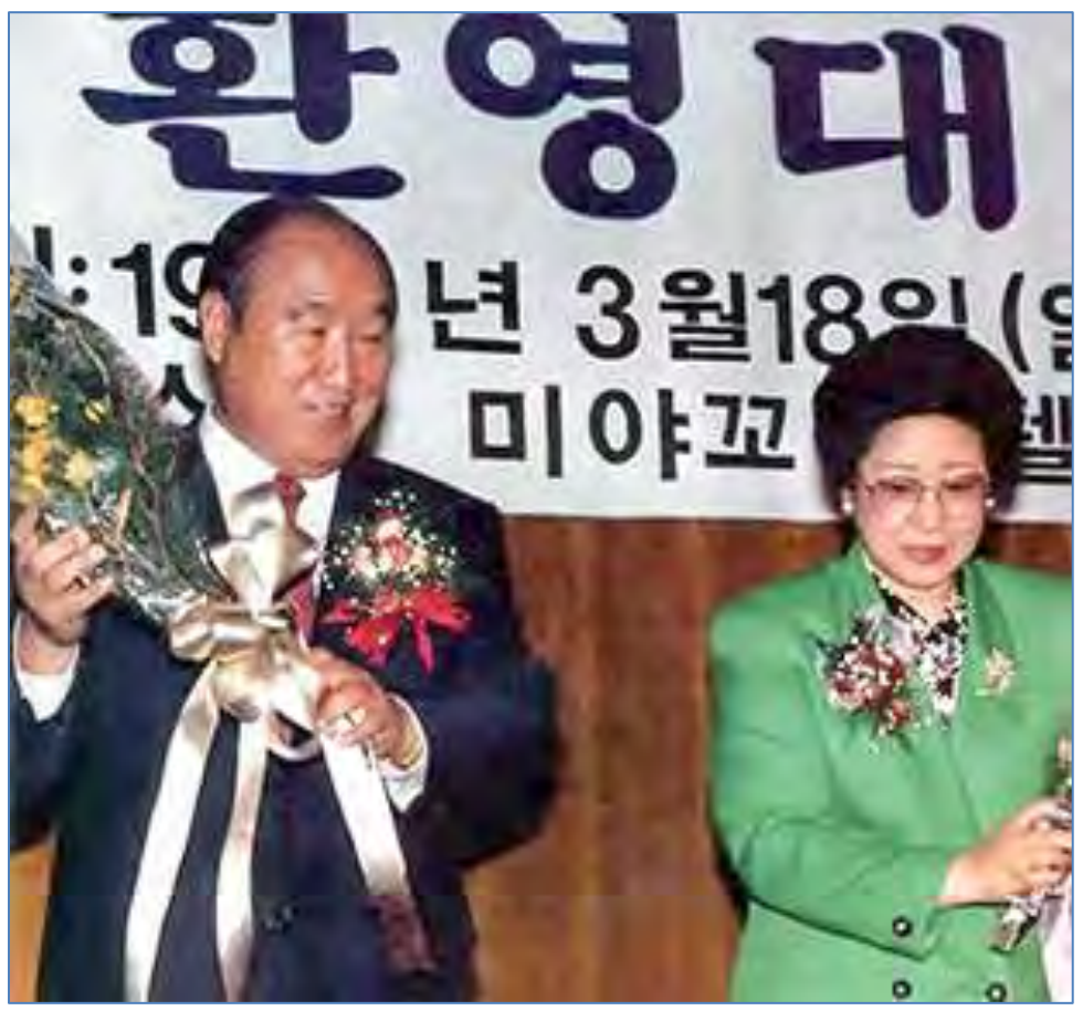
True Parents receive flowers at the San Francisco public speech to the Korean community on March 18, 1990.

True Father Begins Speaking Tour of U.S. Korean Communities