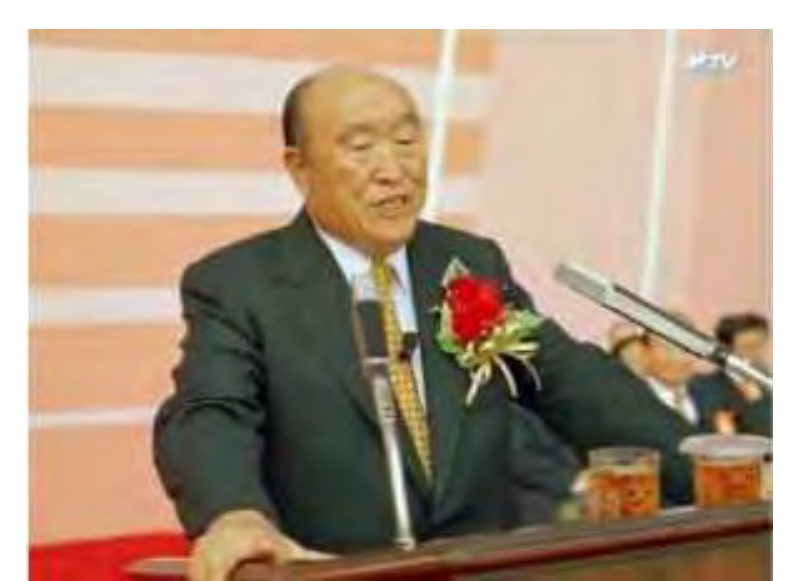
The North Korea–South Korea Unification Rally was held in the Main Olympic Stadium in Jamsil, Seoul, on March 12, 2000.

Held on the foundation of similar events held to commemorate True Father's 80th birthday in 20 Korean cities, it was a national-level event attended by around 120,000 people. In his speech, titled "The Path of Life That Needs to be Trod by God's Princes and Princesses," he proclaimed the age of the brotherhood of humankind.