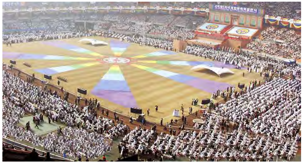
400 million couples receive the Holy Marriage Blessing

Many Unificationists expected that the Holy Marriage Blessing of 360 Million Couples of 1999, which focused largely on previously married couples, would be the final Marriage Blessing in the sequence of international wedding ceremonies conducted on a global and mass scale. Unificationists, therefore, were surprised when True Father announced a 400 Million Couple Blessing to be conducted in conjunction with his 80th birthday, on February 13, 2000. They were more surprised to learn that the 400 million were