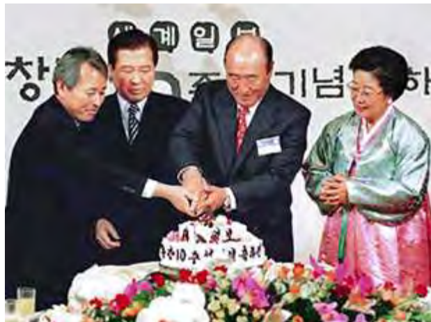
True Father founded the Segye ("universal") Times to be the "window on the world" for the Korean people.

In 1988, following South Korean President Roh Tae-woo's declaration of greater freedom and the Seoul Olympics, the number of newspapers in Korea doubled. True Father founded the Segye ("universal") Times. He intended it to be the "window on the world" for the Korean people. According to True Father: