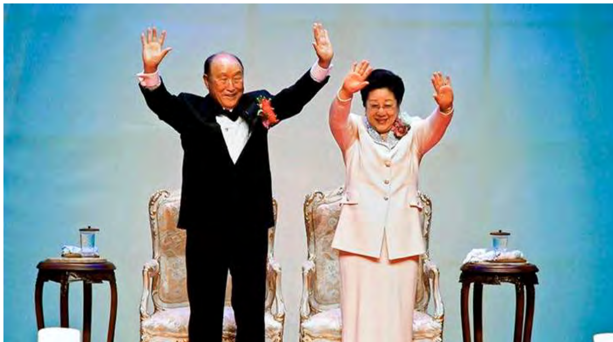
True Father celebrates his 90th birthday.

True Father demonstrated extraordinary dedication and endurance on the occasion of his 90th birthday (and True Mother's 67th) on January 31, 2009, by conducting special Coronations for the Authority and Liberation of God, the King of Kings, both in Korea and the United States. Due to the time difference, True Father was able to deliver a birthday address, officiate at the Coronation ceremony, and be honored at a congratulatory banquet in Korea; then board a plane to New York to address world leaders at the 2009 World Summit on Peace, conduct the Coronation ceremony, and officiate at the Interreligious Cross Cultural Marriage Blessing Ceremony in New York, all on January 31. Congratulatory letters to True Father on his 90th birthday were sent by numerous former national leaders, including former U.K. Prime Minister Margaret Thatcher, former Japanese Prime Minister Yasuhiro Nakasone, and former U.S. President George H.W. Bush.