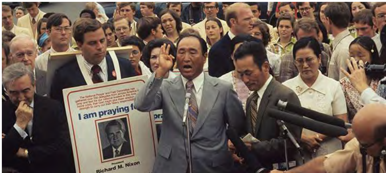
Rev. Moon and members of the Unification Church in America hold a national prayer and fast during the Watergate Crisis at the Capitol Building, Washington, D.C. July 23, 1974.

On January 31, 1974, True Father was invited to the Presidential Prayer Breakfast. A post-breakfast rally at Lafayette Park brought out Edward and Tricia Nixon Cox, the son-in-law and daughter of 37th U.S. President Richard Nixon, who greeted well-wishers who rallied to "Forgive, Love and Unite" as an