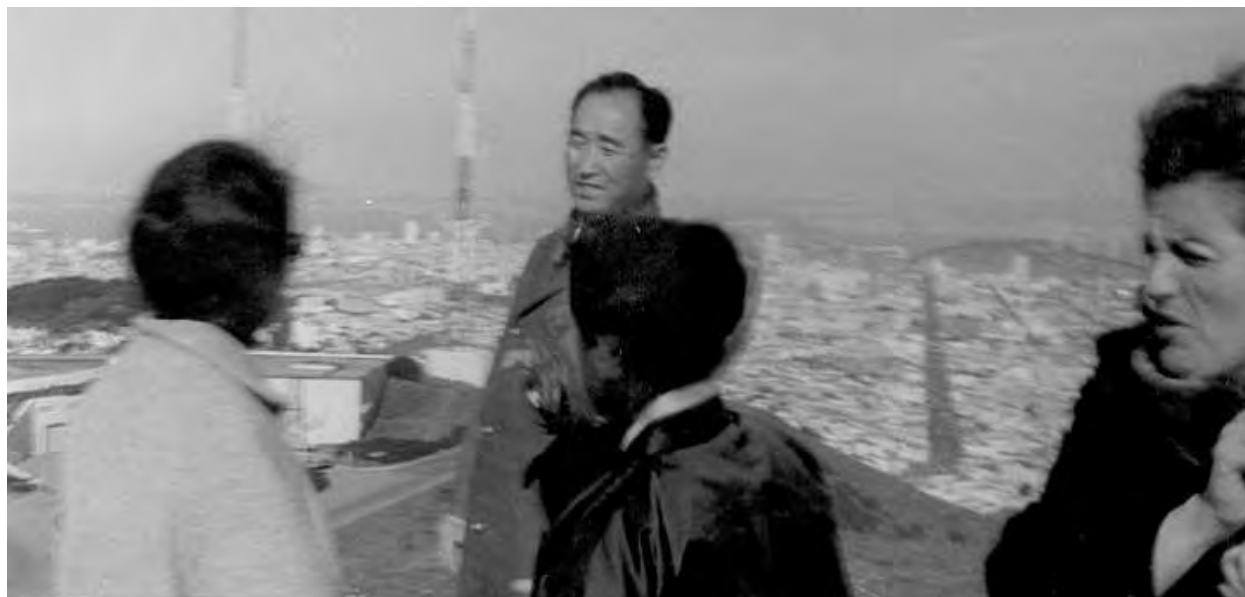
True Father at the Twin Peaks Holy Ground in San Francisco

By the mid-1960s, work in Korea had solidified to the point that the Unification Church was ready to give serious attention to the world mission. The clearest indication of this was True Father's first world tour in 1965. The main purpose of the tour was to connect the foundation that had been established in Korea to the world. True Father commented: