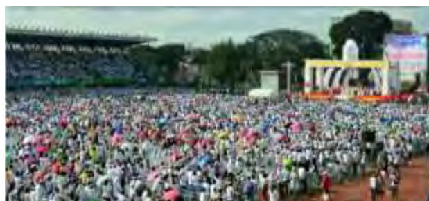
Interfaith Peace Blessing in the Philippines