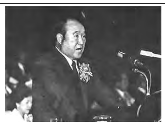
True Father delivers the Citizens' Federation Founder's Address

The "Danbury Course" was decisive in sparking widespread grassroots support for True Father across the United States from minority communities and those concerned about religious and civil liberties. In fact, a broad spectrum of 1,600 clergy and prominent laypeople welcomed True Father back from prison at a "God and Freedom" banquet held in his honor at the Omni Shoreham Hotel in Washington, D.C. A similar event occurred in Korea on December 11, 1985, when some 2,300 dignitaries from a diversity of fields, including a former prime minister of the Republic of Korea, attended a welcoming banquet at the Hilton Hotel Convention Center to pay tribute to the conclusion of True Father's 40-year ministry and to welcome him back to