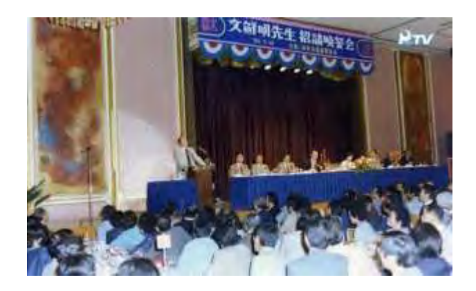
November 7, 1966 Establishment of the Inter-Denominational Christian Association