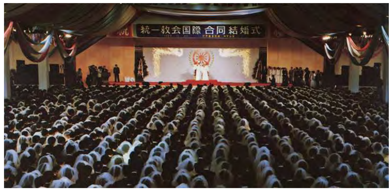
The 6,500 Couple's Holy Marriage Blessing Ceremony, October 30, 1988.

October 30, 1988 6,500 Couple's Holy Marriage Blessing Unites Korean and Japanese in Marriage