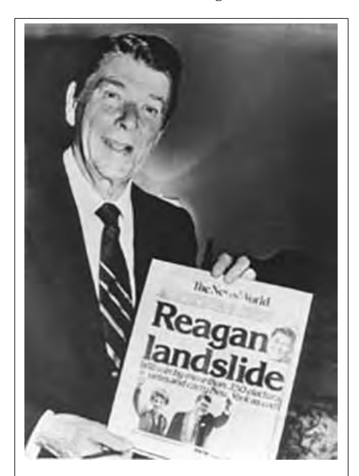
Ronald Reagan holding a copy of the News World, which predicted Reagan's landslide victory on Election Day morning, November 4, 1980.

After the Washington Monument rally of September 1976, True Father "set the deadline" of December 31 for producing the first issue of a new daily newspaper in New York City. On December 31, "the presses rolled early in the morning ... and the first issue of The News World hit the streets of New York." With a color photograph on the front page and a motto that described it as "New York's oldest daily color newspaper," The News World was a 24page general-interest daily with a staff of 200. During the New York City blackout of July 1977, it was the only newspaper to publish, with reporters working by candlelight to write and edit stories. Later, during a three-month newspaper strike that shut down the city's other major dailies, The News World continued to publish, with its circulation soaring to nearly 400,000 daily.