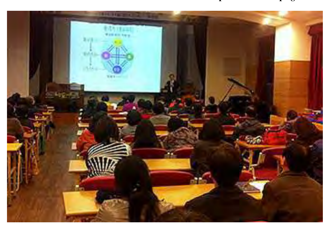
November 2, 2012 The Korean Church Launches a Nationwide Divine Principle Revival Campaign

Participants listen to a Divine Principle lecture at the No-won Church during the three-day lecture series on November 2-4, 2012 as part of the first of three 40-day Revival Campaigns.