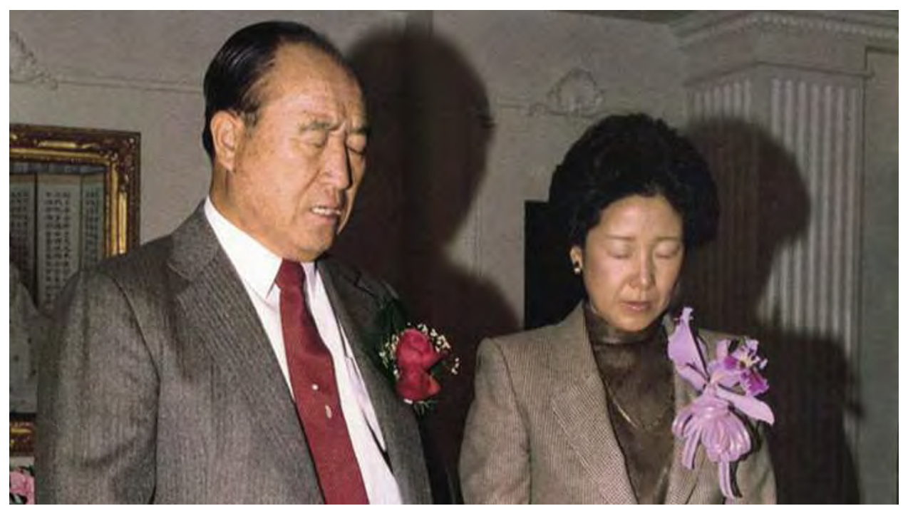
True Parents dedicate the CAUSA International Headquarters.

True Father set up CAUSA, from the Latin word for "cause," in 1980 following the fall of Nicaragua in 1979 to Marxist Sandinistas. The overwhelming success of CAUSA programs in Latin America in ideologically arming students, union leaders, teachers, government officials and police who previously had been exposed to Marxist theory led to CAUSA's expansion to the United States. In 1983, construction of CAUSA International Headquarters began in the Tiffany Building on Fifth Avenue in New York City. In addition to a main hall equipped with highly advanced multimedia equipment and seating for 200, renovated space included 22 offices. Among these were CAUSA libraries for research, the CAUSA Institute, and multimedia rooms for the preparation of lecture slides and diagrams. True Parents dedicated the facility, cutting a ceremonial ribbon and encouraging staff at a celebration banquet on November 2, 1983. The following year, CAUSA sponsored 34 major conferences and 290 local programs.