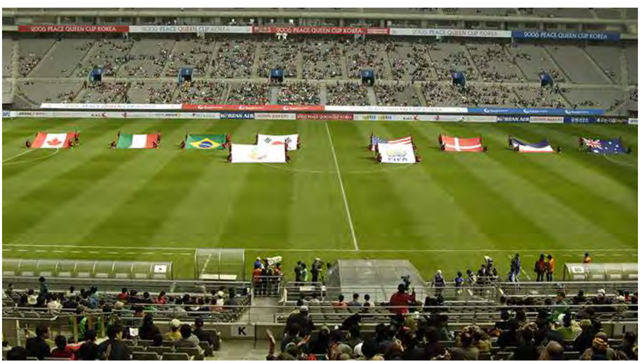
The Inaugural Peace Queen Cup Tournament is held in South Korea.

Following the 2002 World Cup soccer tournament jointly sponsored by Korea and Japan, True Father