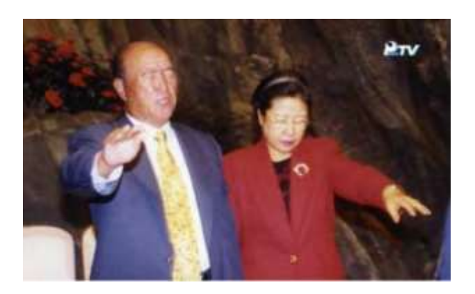
October 23, 1999 Declaration of the Day of Liberation of the Blessing for the Entire Cosmos

On October 23, 1999, the Declaration of the Day of Liberation of the Blessing for the Entire Cosmos was held in East Garden, beginning at 7:00 a.m. In attendance were the children of True Parents and around forty movement leaders. On this day True Father said, "As of today, I proclaim the unity of the four great realms of the heart, the liberation of creation, the liberation of children, the liberation of a couple and the liberated realm of the True Parents of Heaven and Earth." Based on this victorious foundation, True Father said we had entered the era of the realm of absolute ownership in which God can freely act. It was at this declaration that True Father instructed that holy wine and pure love candy be distributed to people