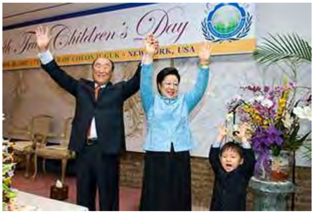
True Parents celebrate the 48th Children's Day and cheer with their grandson