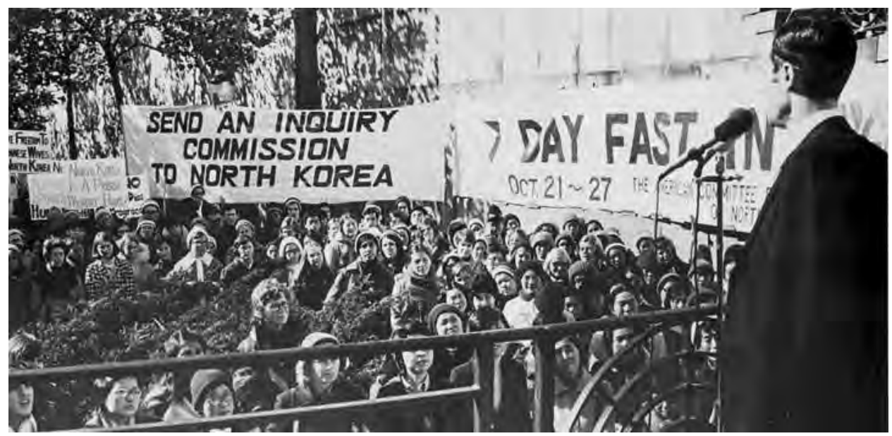
Protestors hold a 7-day fast on behalf of wives in North Korea