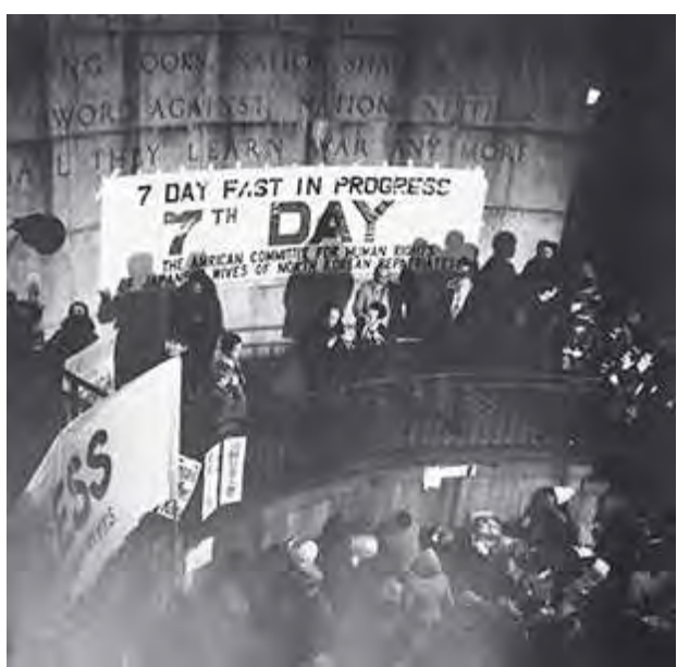
True Father speaks at the conclusion of the 7-day fast

Seven hundred Unificationists fasted for seven days in front of the United Nations in New York from October 21-27, 1974, to protest the treatment of Japanese wives of North Korean repatriates. True Father initiated the fast for humanitarian and providential reasons. He noted that Korean men living in Japan who married Japanese women and then repatriated to North Korea had "cheated" the wives who were "now ill-treated and persecuted under the regime." In this connection, the Unification Church published a volume of testimonies from these women, If I Had Wings Like a Bird, I Would Fly Across the Sea, which publicized their plight. Apart from the humanitarian issue, Unificationists undertook the fast within the context of a North Korean proposal, which had gained traction in the UN General Assembly, that called for UN forces to be removed from South Korea. True Father stated that the fast's purpose was to "make naked the evil reality of what they are doing in North Korea and in all the communist regimes." Unificationists' efforts continued after the fast, and on December 9, 1974, the UN General Assembly approved a U.S.-sponsored resolution providing for maintenance of the United Nations Command in South Korea.