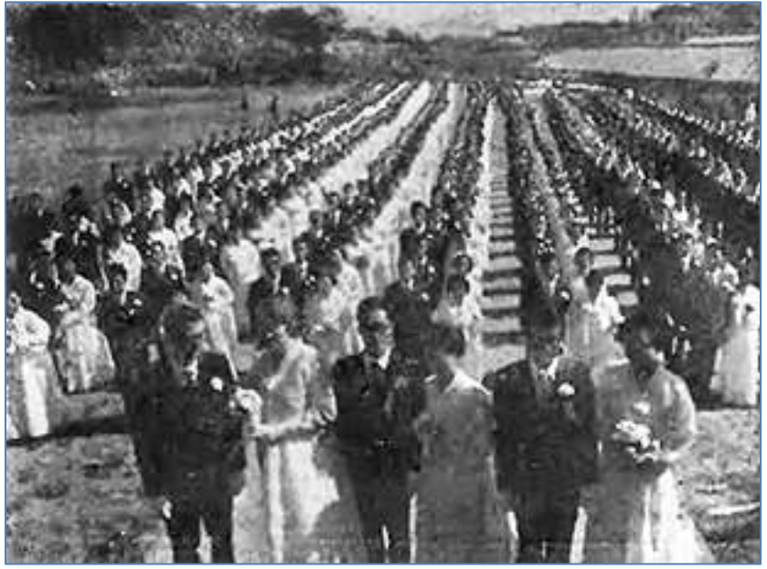
Rehearsal of the International Wedding Ceremony of 777 couples at Sutaek Ri

True Parents presided over the first truly international Marriage Blessing Ceremony when they blessed 777 couples on October 21, 1970. As part of the 430 Couples Holy Marriage Blessing in 1968, True Parents blessed 43 non-Korean couples overseas in 1969. For the 777 Couples Holy Marriage Blessing, participants came from 10 nations to Korea. The Marriage Blessing was conducted at Seoul's Changchung (Metropolitan) Gymnasium in the presence of over 15,000. True Father stated that this was the last Marriage Blessing that he would conduct "before globalizing my mission." He noted that the 777 Couples Holy Marriage Blessing was the seventh following True Parents' Holy Wedding. This Marriage Blessing lay the foundation for the Unification movement to work on the worldwide level. "What belongs to Korea," he said, "can now belong to the world and vice versa."