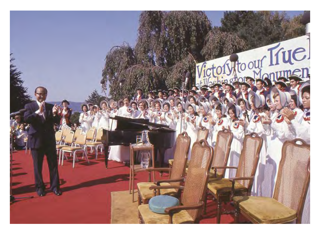
The Washington Monument Rally in Washington, D.C. also took place 42 years ago today, where True Father spoke before 300,000 people, and was the second of two major rallies celebrating the United States' bicentennial in 1976, the first being the Yankee Stadium rally on June 1.

At the Washington Monument, True Father spoke on "America and God's Will." He stated, "The United States of America, transcending race and nationality, is already a model of the unified world." He also said that Judaism, Christianity and the Unification Church as sibling faiths and Israel, the United States and Korea as sibling nations had "a common destiny representing God's side" and needed "to restore the United Nations to its original purpose and function." He called upon the three religions and three nations to "join hands in a unified effort," contributing "internally to the unification of world religions and externally to the unification of the world itself."