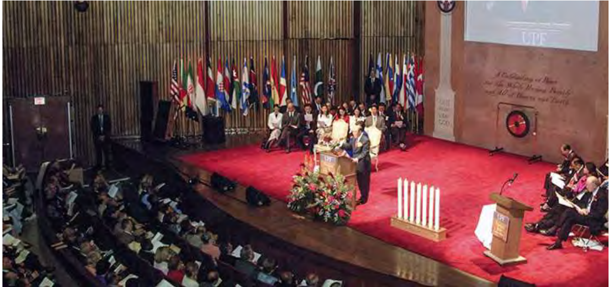
True Father speaks at the inauguration of the Universal Peace Federation on September 12, 2005.

True Father established the Universal Peace Federation (UPF) on September 12, 2005, prior to the United Nations' 60th anniversary. Its inaugural convocation was held before 376 delegates from 157 nations at Lincoln Center's Alice Tully Hall in New York. Its mission, True Father declared, was "to renew the existing United Nations and provide a new level of leadership as an 'Abel-type' United Nations." As part of the launch, he also proposed a "World Peace King Bridge Tunnel" to "build a passage for transport across the Bering Strait." He described this as "a truly providential and revolutionary project" and envisioned it as a crucial "link" in "an international highway system connecting the world as a single community." UPF was a successor organization to the Interreligious and International Federation for World Peace (IIFWP, established in 1999). In addition to its UN renewal and Bering Strait initiatives, UPF led the movement's Middle East Peace Initiative (MEPI), which sponsored interfaith "Pilgrimages for Peace," and its Northeast Asia Peace Initiative (NEAPI), which supported Korean unification.