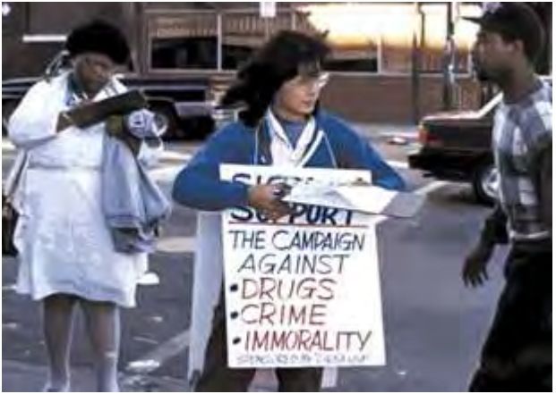
A woman collects signatures for CAUSA USA

True Father planned to conduct a Moscow rally by 1981, but this was prolonged for nearly a decade due to court battles in the United States and the need to build up a stronger church. Having concluded the "Danbury Course" and established a multifaceted presence in America by 1985, True Father mounted a march to Moscow from 1985 to 1990. He understood that the Soviets respected strength and that any