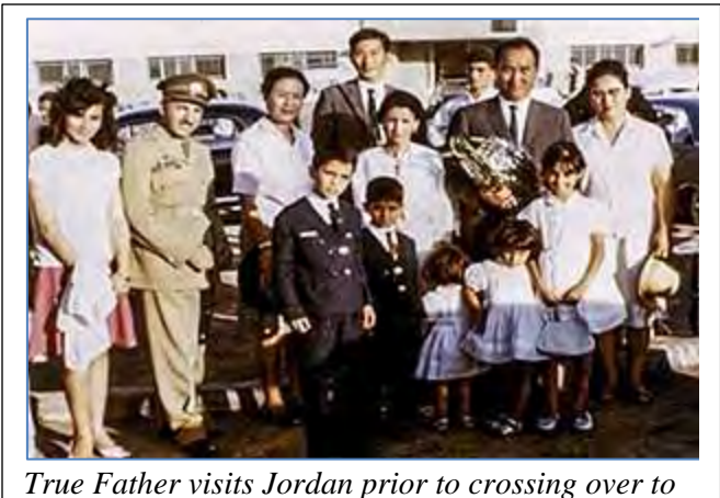
August 31, 1965 True Father Prays at Calvary and Gethsemane