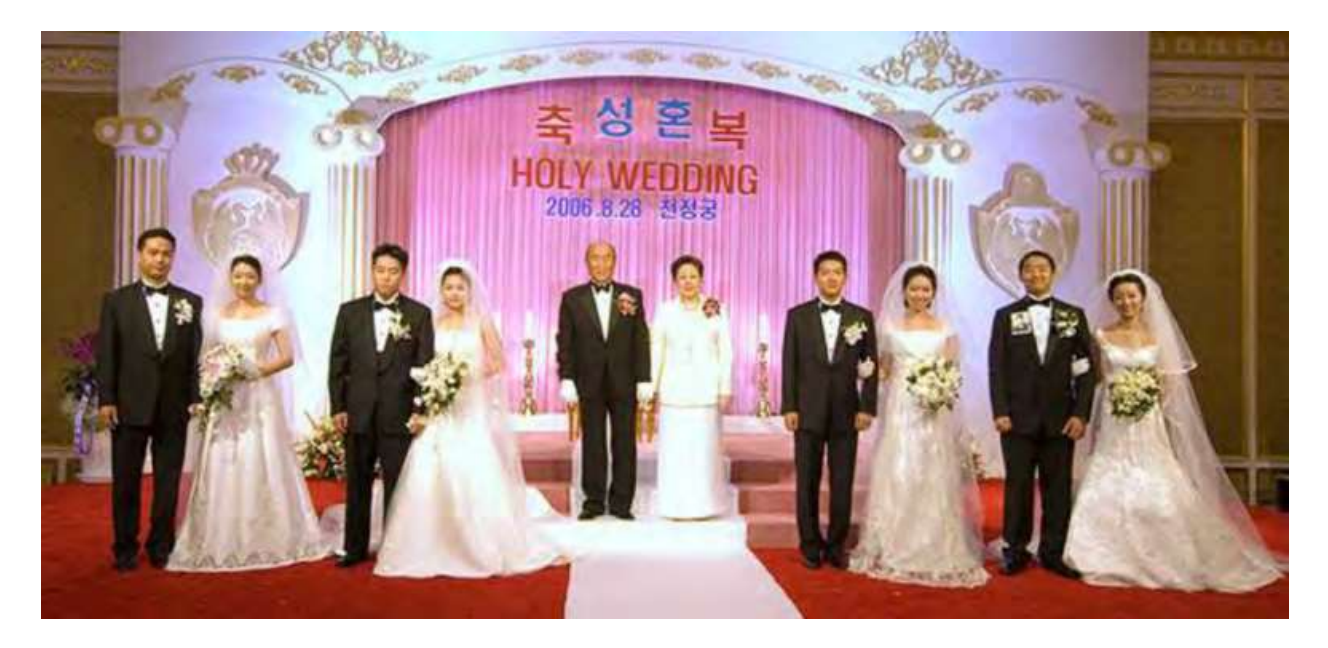
August 28, 2006 Holy Blessing of the Third Generation

True Parents officiated a Holy Wedding Ceremony for the third generation of Unificationists, which included some of their own grandchildren (seen on stage). On the foundation of True Parents' victory in realizing God's kingdom of a peaceful, ideal world, a Holy Wedding Ceremony was officiated by True Parents on August 28, 2006.