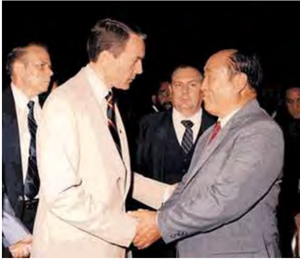
After the Senate Judiciary Subcommittee on the Constitution hearing, Sen. Orrin G. Hatch and True Father shake hands

After the Court of Appeals denied True Father's appeal and upheld his eighteen-month sentence for tax evasion, the U.S. Senate Judiciary Committee's Subcommittee on the Constitution convened a hearing on religious freedom. Chaired by Senator Orrin Hatch (R-Utah), the hearing looked into whether the verdict in True Father's case had been a violation of religious freedom. More than three hundred invited persons and observers as well as media crews were present. In his prepared remarks , True Father stated, "In 1971, God called me to come to America and ... for the last 12 years I have given my heart and soul and every drop of sweat and tears for the sake of this nation." He listed a number of the vast array of projects undertaken by the movement at the cost of "several hundred million dollars," denied that he had defrauded the U.S. government of a few thousand dollars, and expressed gratitude that God was "using me as an instrument to lead the fight for religious freedom and to ignite the spiritual awakening of America."