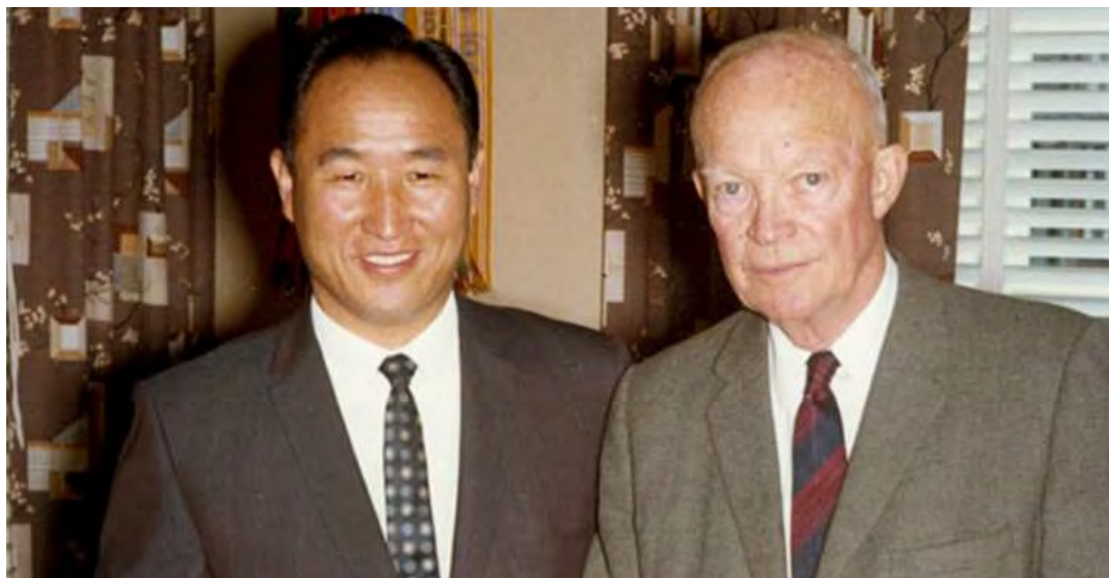
True Father and President Dwight D. Eisenhower