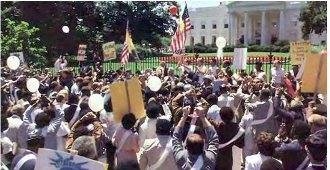
The Rally for Justice and Religious Freedom took place on June 25, 1985