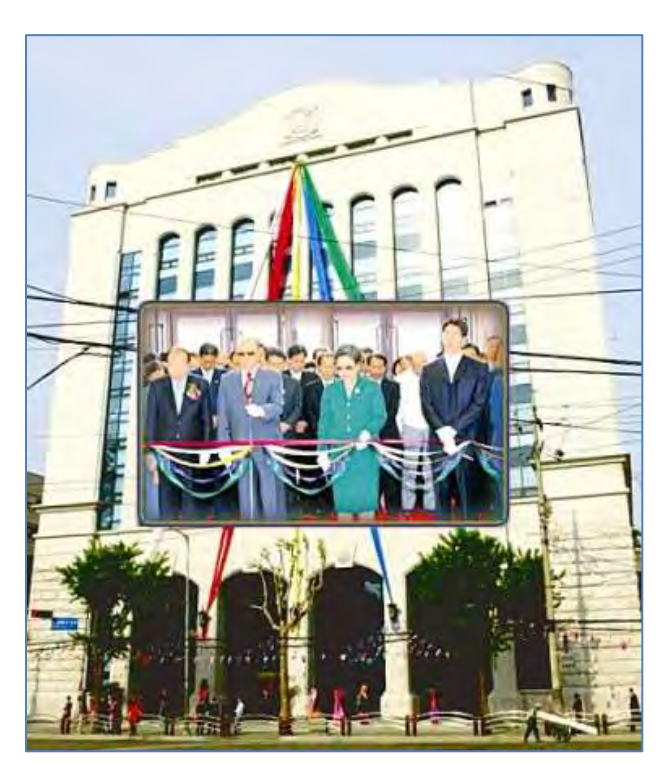
May 5, 2005 New FFWPU Headquarters Building Dedicated in Korea

The dedication ceremony for the new FFWPU Headquarters building was held on May 5, 2005, with the attendance of True Parents. The headquarters consisted of four floors under ground level and nine floors above ground level. Construction began in June 2003 and took a little over two years. Some 1,000 people gathered for the ceremony. True Father offered a simple prayer in the lobby before cutting the tape. True Parents then presided over the sprinkling of holy salt to sanctify the new building. True Father wrote calligraphy for the new building: "Mansei for the Kingship of Peace throughout Heaven and Earth" (unofficial translation) and then went up to the 8th floor to participate in the main ceremony.