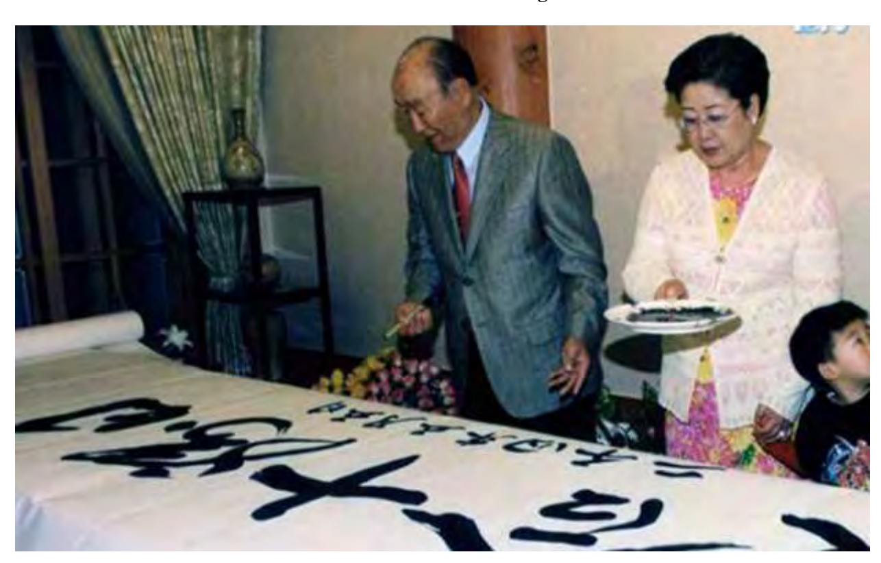
On May 1, 2004, the Holy Spirit Association for the Unification of World Christianity (HSA-UWC), or