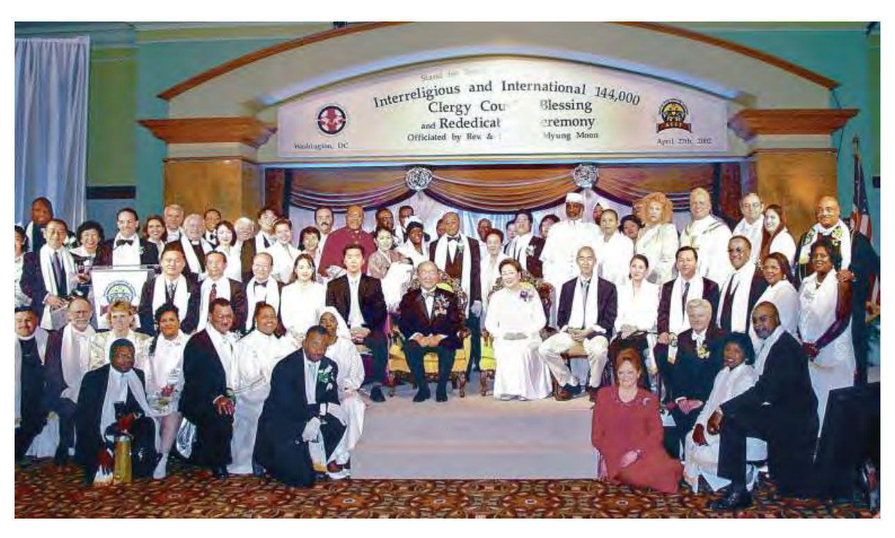
April 27, 2002 144,000 Clergy Interfaith Marriage Blessing