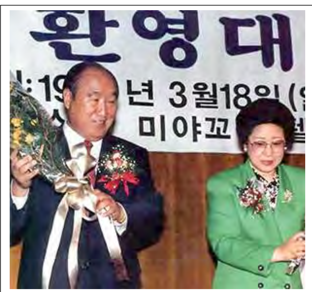
True Parents receive flowers at the San Francisco public speech to the Korean community on March 18, 1990

True Father launched his first U.S. speaking tour since the 1970s, addressing Korean communities in five U.S. cities, beginning in San Francisco on March 17, 1990. The other cities were Los Angeles, Chicago, Washington, D.C., and New York, and True Father said the five cities represented the 50 states of America. True Father spoke on the topic "True Unification and One World." The events were promoted as "Welcoming True Parents Rallies." They served to introduce True Parents' activities and thought to Koreans in America and to familiarize the Korean community with the term "True Parents." True Father had conducted "Welcoming True Parents" rallies in five Korean cities the previous month. These rallies were part of the lead-up to the Moscow Rally in April 1990 and True Parents' declaration of their roles on the worldwide level.