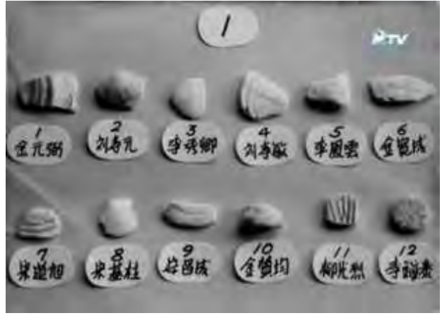
March 13, 1960 Decorative Stones Distributed at Cheongpadong Church