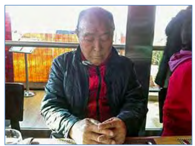
True Father in Las Vegas, praying for the safety of Japan after the earthquake

A 9.0 magnitude undersea earthquake approximately 43.5 miles off the Japanese coastline on March 11, 2011, triggered a powerful tsunami, with waves reaching heights of up to 133 feet, which, in the area of the city of Sendai, traveled up to 6 miles inland. Referred to in Japan as the Great East Japan Earthquake, it was the most powerful earthquake ever recorded to have hit Japan, and the fourth most powerful earthquake in the world since modern record-keeping began in 1900. The earthquake moved Honshu (the main island of Japan) 8 feet eastward and shifted the Earth on its axis by between 4 and 10 inches. A Japanese National Police Agency report confirmed 15,889 deaths, 6,152 injured, and 2,601 people missing across twenty prefectures, as well as 127,290 buildings totally collapsed, with a further 272,788 buildings "half collapsed" and another 747,989 buildings partially damaged. The tsunami caused level 7 nuclear meltdowns at three reactors in the Fukushima Daiichi Nuclear Power Plant complex, affecting hundreds of thousands of residents in an 18-mile radius who were forced to evacuate. The World Bank's estimated economic cost was US $235 billion, making it the costliest natural disaster in world history.