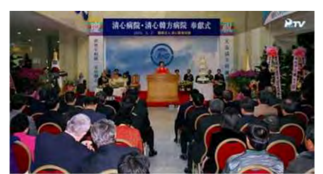
True Mother speaking at the hospital dedication ceremony

February 5, 2003 Dedication of Cheongshim International Hospital