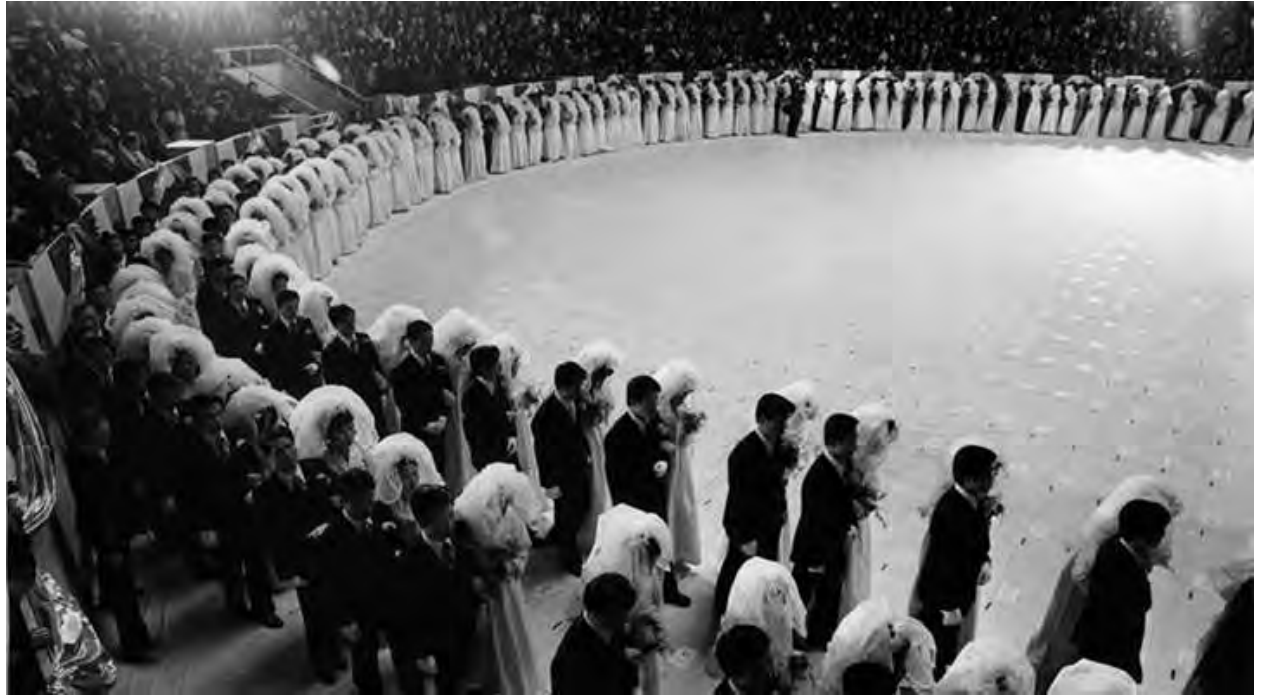
True Parents bless 1800 couples in marriage

True Parents blessed 1,800 couples (technically, 1801) in what the Guinness Book of World Records then recorded as the largest mass wedding in history on February 8, 1975. The ceremony, conducted in Seoul's Jangchung Gymnasium, brought together couples from 25 nations, including 891 couples from Korea, 797 from Japan, 76 from the United States, 35 from European countries and two from the Republic of China. Over 10,000 guests witnessed the event, after which couples boarded ninety-four sightseeing buses for a parade through the streets of Seoul. True Parents blessed the 1,800 Couples 14 years after their Holy Marriage Blessing in 1960. It closed out the second 7-year or national-level course and opened the way to the Unification Church's international work. Some 300 members from the 1,800 Couples went out to 123 nations as foreign missionaries, pioneering the worldwide providence. True Father noted that 1,800 represents three times six, equaling eighteen or "the complete subjugation of the satanic number 6." The 1,800 Couples, he said, "represent all humankind." Upon their Blessing, he declared, "we enter the age to embrace the world." This year marks the 40th anniversary of the 1,800 Couple Blessing.