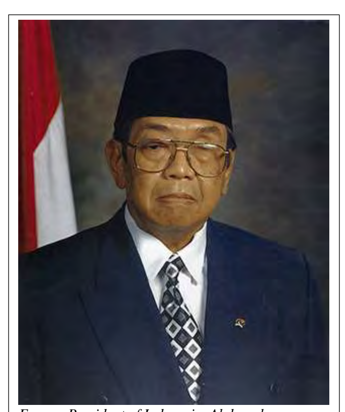
Former President of Indonesia, Abdurrahman Wahid, met with True Father at the World Summit of Muslim Leaders.

A little more than a month after the tragic events of 9/11, True Father hosted Assembly 2001, "Global Violence: Crisis and Hope," in New York City from October 19 to 22, 2001. It convened 380 political and religious leaders from 101 nations. During the conference, True Father met with Abdurrahman Wahid, the former president of Indonesia and longtime head of the Nahdlatul Ulama, the largest independent Muslim organization in the world. True Father also met with Nation of Islam leader Minister Louis Farrakhan and urged the two to work together. A month later at a breakfast meeting with Unificationist leaders, True Father suddenly insisted, "Muslims should hold a peace meeting before the end of the year. Ask H.E. Wahid and Minister Farrakhan if they will convene such a conference. I will help if needed." Dr. Frank Kaufmann reported, "Within 22 days, 180 Muslim leaders from 51 countries sat in the ballroom of the newly opened JW Marriott Jakarta to welcome speakers for the opening plenary of the World Summit of Muslim Leaders discussing Islam and a future world of peace." Minister Farrakhan and H.E. Wahid acted as coconveners ably supported by IRFWP staff.