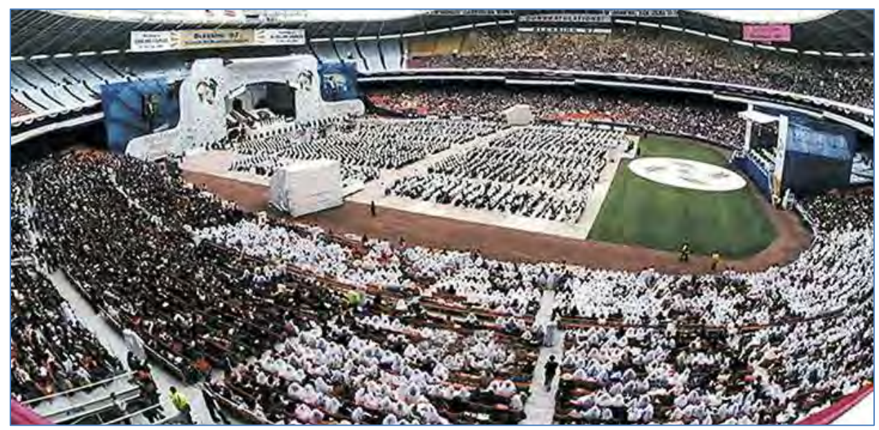
An aerial view of the 3.6 Million Couples' Marriage Blessing Ceremony

True Parents conducted the 3.6 Million Couples' Holy Marriage Blessing Ceremony at Washington, D.C.'s Robert F. Kennedy (RFK) Stadium on November 29, 1997. This was the first major Blessing in the United States since 1982 and was an exponential leap beyond the Holy Blessing of 360,000 Couples at Seoul Olympic Stadium in 1995. The 1997 Blessing was conducted within the context of the third World Culture and Sports Festival (WCSF) from November 23-30.