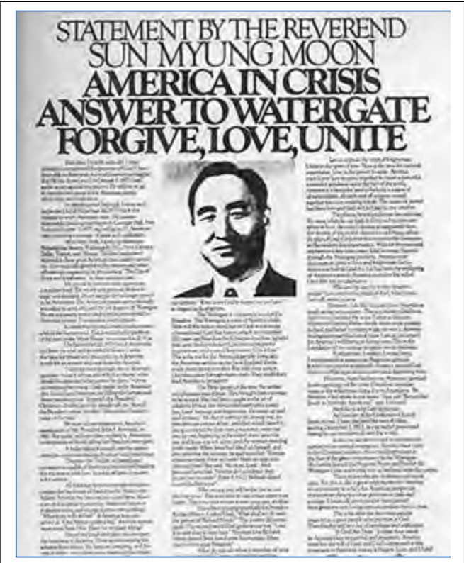
True Father's "Answer to Watergate" statement appeared in newspapers in 21 cities

The "Watergate Crisis," which implicated the White House in a break-in of the Democratic Party's National Headquarters in 1972. embroiled the United States in controversy and weakened it in the face of communist aggression in Vietnam. True Father viewed this as "more than a political, social and economic crisis." He viewed it as "a crisis of the human soul" and, because of America's position in the world, as "a crisis for God." As a consequence, he took two weeks off from his 21-City Day of Hope speaking tour in late 1973 and returned to Korea "in a desperate search for an answer and new hope for America." His conclusion was that "God's command at this crossroads in American history is Forgive, Love and Unite!"