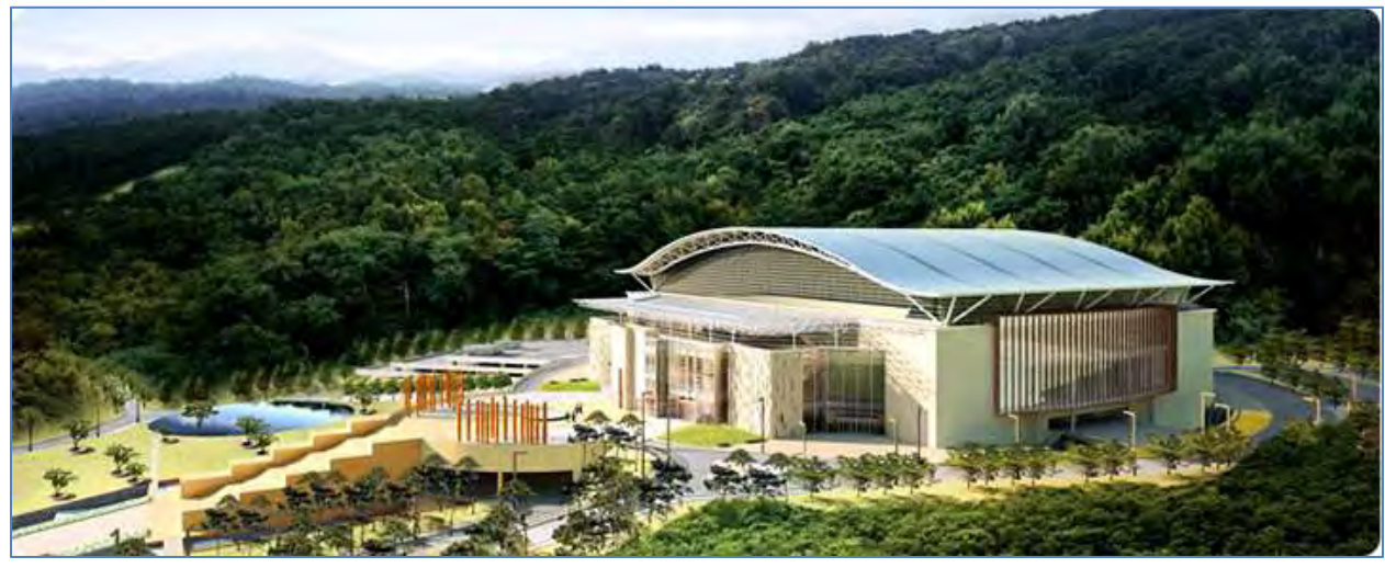
Design plans for the Cheongshim Peace World Center.

Three thousand people attended the groundbreaking ceremonies for the Cheongshim Peace World Center on October 28, 2008. Designed to hold 25,000 people, it was created to be the largest and most sophisticated multipurpose cultural center in South Korea, eight times larger than the Sejong Center for the Performing Arts and twice as large as the Olympic Gymnastics Hall, both located in Seoul. With three floors underground and four floors above, it was designed to be the first Korean arena with folding chairs, a state-of-the-art moving stage and an audiovisual system to host an array of events including concerts, business conventions, corporate events, indoor sports competitions, educational events, expositions and television commercials. The arena would take three years to complete and addressed True Father's longheld desire to see an iconic center for global culture near Chung Pyung Lake.