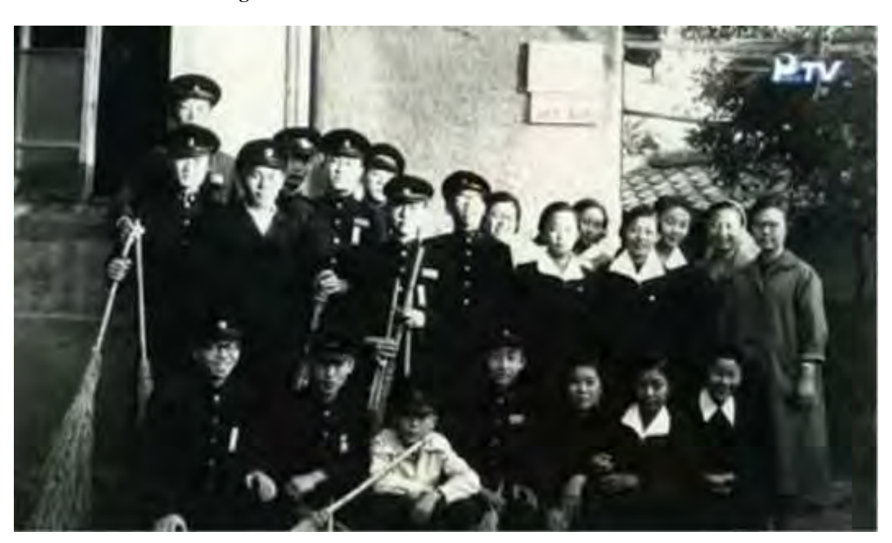
October 23, 1955 Establishment of the Seonghwa Student Council

The Seonghwa Student Council was founded on October 23, 1955. At the beginning of that month, True Father was found innocent of draft evasion and released from Seodaemun Prison. The headquarters church was then moved to Yeongsan Gu, Cheongpa Dong.