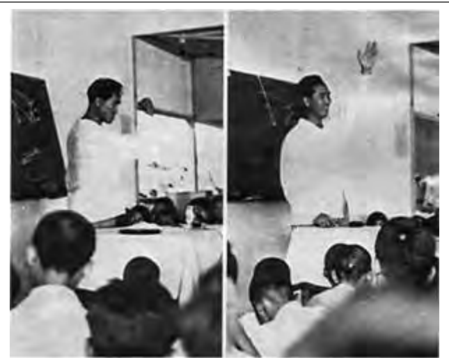
True Father teaching at Cheongpa Dong

Three days after True Father's release from Seodaemun Prison, the church borrowed 2 million won to purchase an abandoned building in poor repair on a hillside in Cheongpa Dong, Seoul.