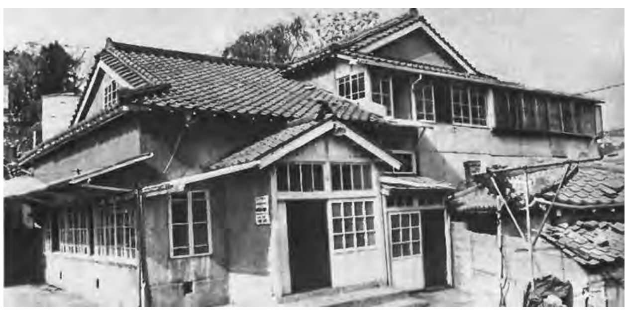
The old Cheongpa Dong church, formerly a Japanese temple, with its clay tile roof