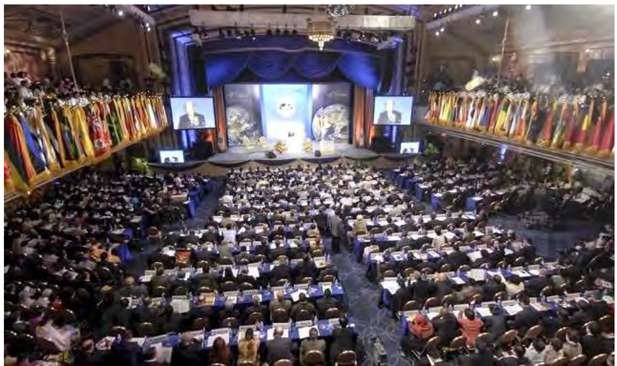
True Father launched the "Substantial" Abel UN at the Manhattan Center