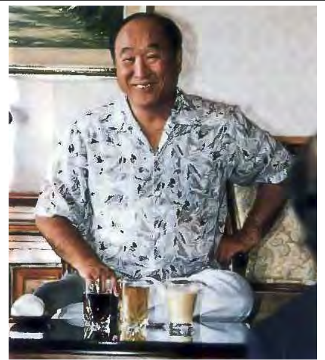
True Father welcomes the representatives of 120 nations to his home in Korea for the Seoul Olympics

The Games of the XXIV Olympiad took place from September 17 to October 2, 1988, in Seoul. The "Seoul Olympics" were significant not only for Korea as the second Asian nation to host the Olympic Games but also for the world, as the games brought together athletes from the communist and free-world nations for the first time since 1976. These also were the last Olympic Games for the Soviet Union and East Germany, both of which would cease to exist by the time of the next Olympic Games in 1992. True Father recognized this and made a special effort to welcome Eastern Bloc and Soviet athletes, providing them with generous gifts and invitations to cultural events. Although Coca-Cola was the official soft drink of the Games, athletes, friends and officials of many nations accepted more than 40,000 cans of McCol and bottles of Ginseng-Up. Following the completion of the Games, True Father proposed the holding of a World Festival of Culture (later designated as the World Culture and Sports Festival) as an "internal" complement to the Olympic Games.