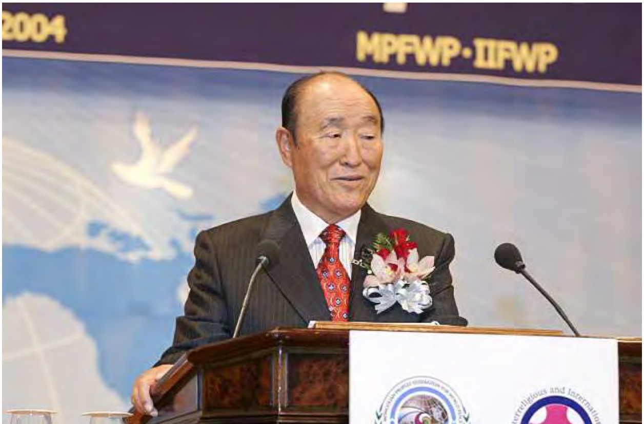
True Father speaks at the International Peace Conference for Mongolian Leaders from Around the World

True Father established numerous Federations for World Peace following the end of the Cold War and into the new millennium. From September 21-24, 2004, the first International Peace Conference for Mongolian Leaders from Around the World took place in Seoul. This conference led to the creation of the Mongolian Peoples' Federation for World Peace (MPFWP). True Father defined Mongolian peoples as those born with the Mongolian birthmark, a bluish mark usually seen on the backside. He asserted that nearly three-quarters of the world's population is linked to Mongolian roots and that the Mongolian birthmark appears not only in persons of the yellow race but also among many black and white people. He maintained that values preserved among Mongolian peoples, such as faith in absolute values, an understanding of human spirituality, belief in the existence of the spirit world, an emphasis on family tradition and the importance of lineage would play a significant role in bringing about the realization of a world of peace. The initial conference brought together 300 participants from Mongolia, Korea, Japan, China and 34 other nations. The Mongolian Federation convened subsequent meetings under the auspices of the Universal Peace Federation.