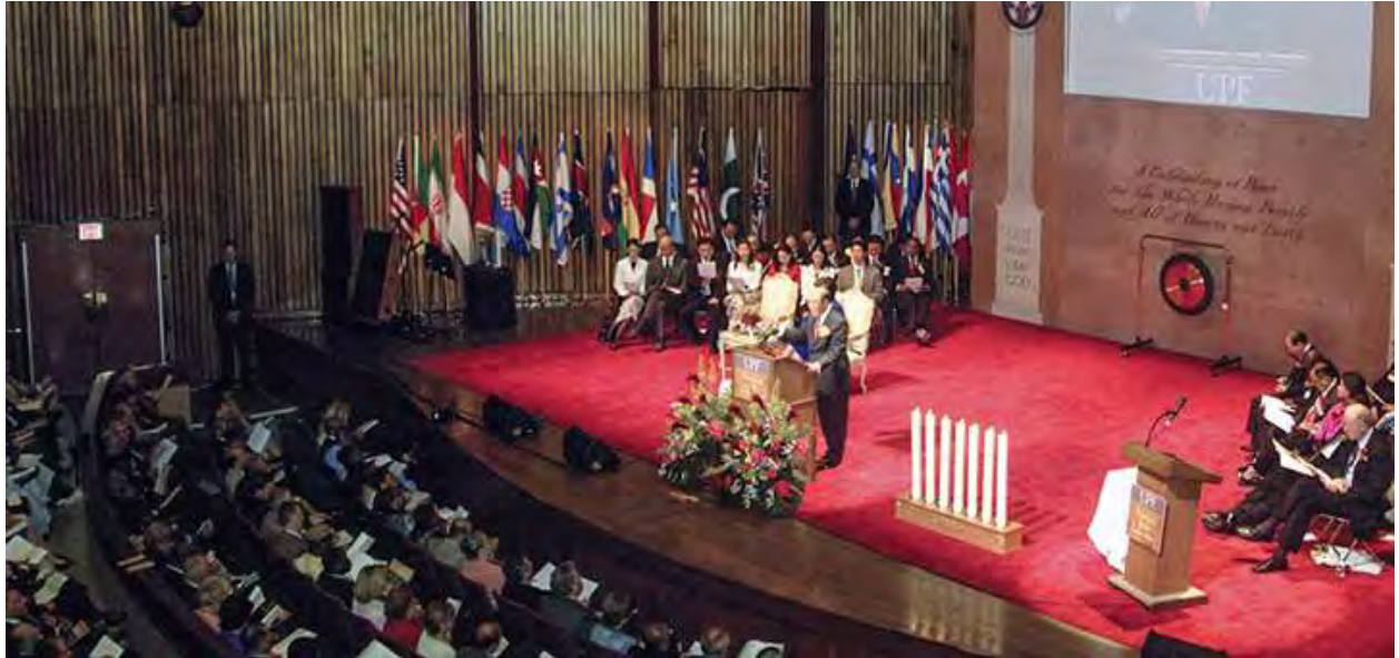
True Father speaks at the inauguration of the Universal Peace Federation on September 12, 2005

True Father established the Universal Peace Federation (UPF) on September 12, 2005, prior to the United Nations' 60th anniversary. Its inaugural convocation was held before 376 delegates from 157 nations at Lincoln Center's Alice Tully Hall in New York. Its mission, True Father declared, was "to renew the existing United Nations and provide a new level of leadership as an 'Abel-type' United Nations." As part of the launch, he also proposed a "World Peace King Bridge Tunnel" to "build a passage for transport across the Bering Strait." He described this as "a truly providential and revolutionary project" and envisioned it as a crucial "link" in "an international highway system connecting the world as a single community." UPF was a successor organization to the Interreligious and International Federation for World Peace (IIFWP, established in 1999). In addition to its UN renewal and Bering Strait initiatives, UPF led the movement's Middle East Peace Initiative (MEPI), which sponsored interfaith "Pilgrimages for Peace," and its Northeast Asia Peace Initiative (NEAPI), which supported Korean unification.