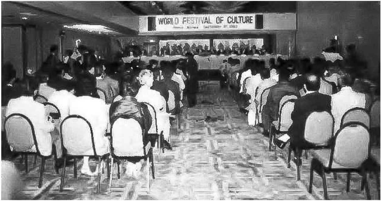
The press conference announcing the World Festival of Culture

On September 14, 1999, True Father opened the era in which blessed families were no longer to pray in the name of True Parents or any mediator but in their own names as blessed couples who have inherited True Parents' realm of victory. True Father explained that this was meant to mark the era of "personal responsibility." He said that couples should "report their work" and that it was no longer "a time to pray to receive blessings." This guidance was consistent with True Father's view that humankind had entered the Completed Testament Age.