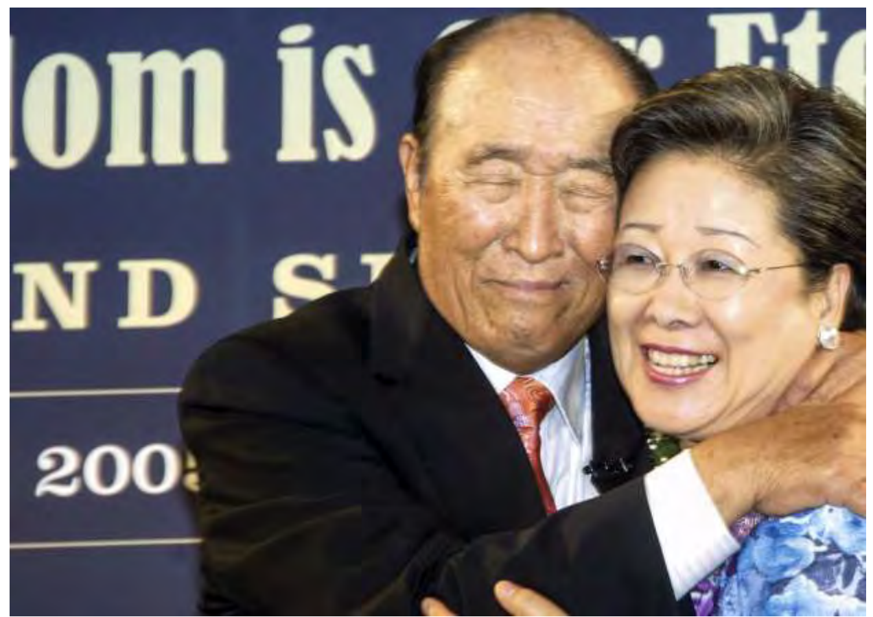
True Parents at the inauguration of the Universal Peace Federation on September 12, 2005