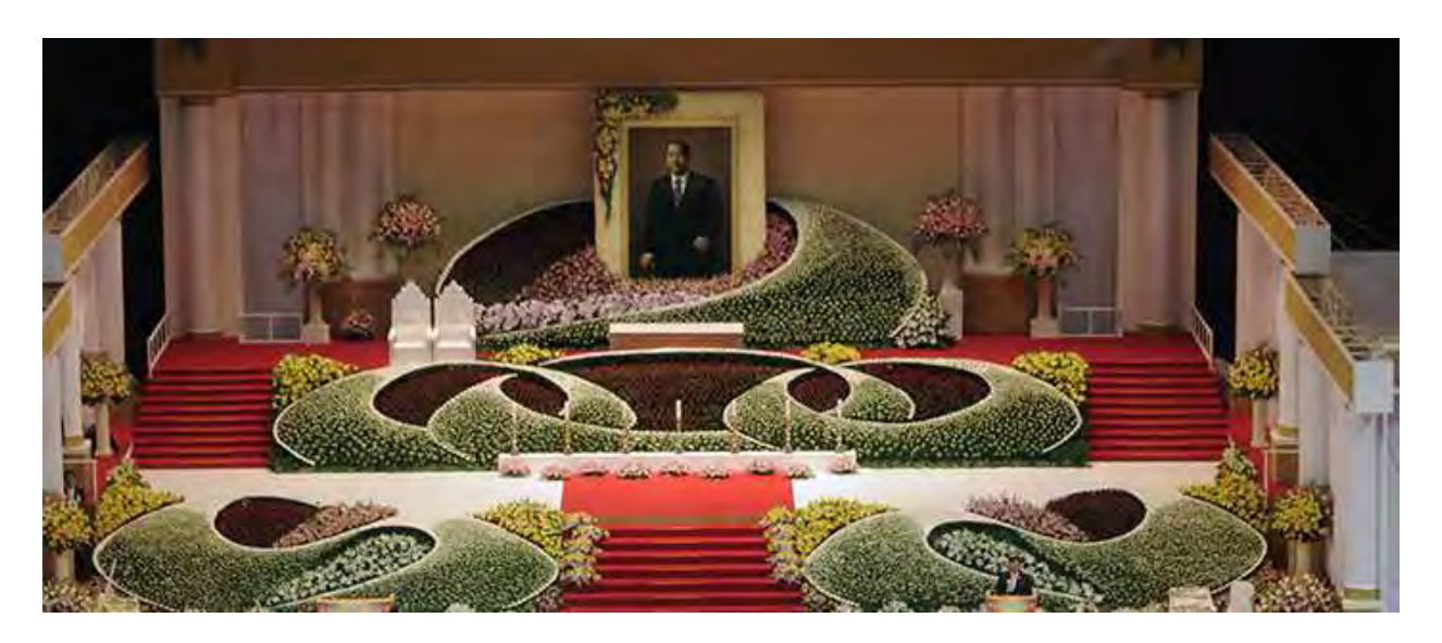
True Father ascended to the spirit world on September 3, 2012 and his Seonghwa (ascension) ceremony was held in Korea.

September 3, 2012 True Father's Ascension