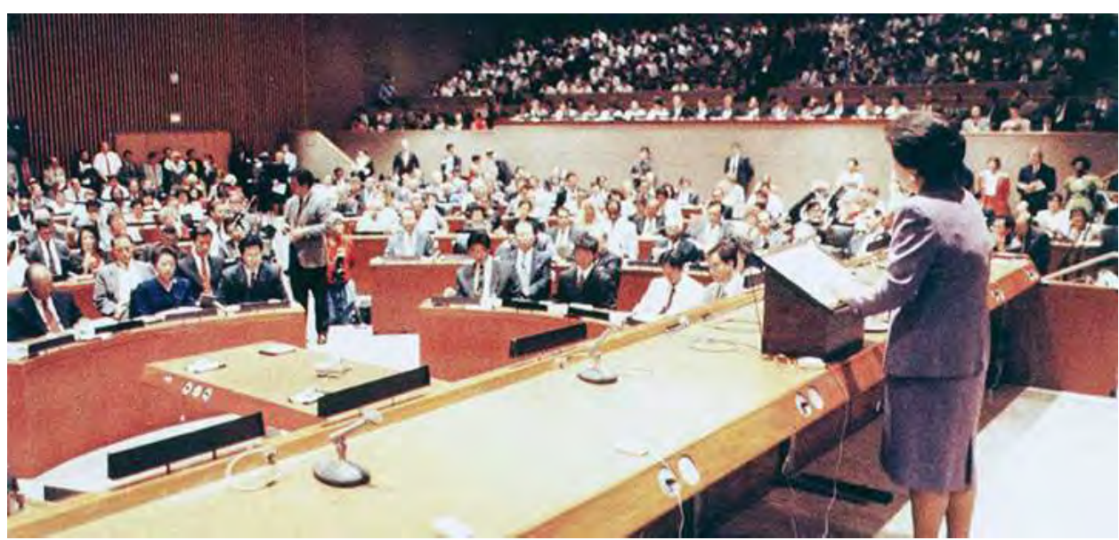
True Mother gives her address at the UN headquarters September 7, 1993.