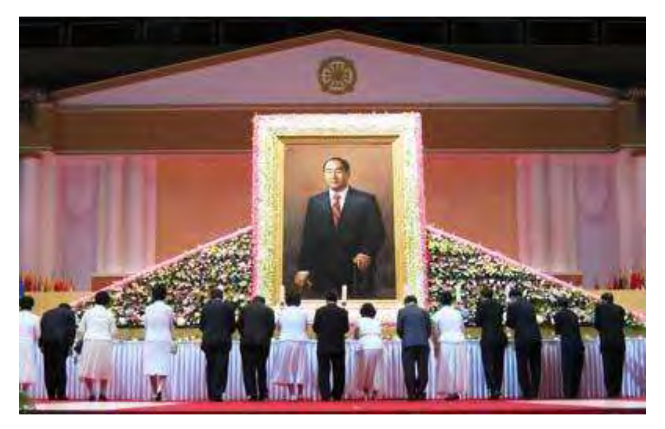
September 6, 2012 True Father's Body Lies in State as Thousands Gather to Say Goodbye

Elected leaders, diplomats, clergy and academics from Korea and abroad were among 15,000 mourners who gathered on September 6, 2012, to pay their respects to True Father. Visitation at the Cheongshim Peace World Center was held from September 6 to 14 from 8 a.m. until 10 p.m. Visitors first watched a video of True Father and then moved to the first basement floor, where they received either an offering rose or a lily. They then had the opportunity to electronically input their names and a message to True Father. Numerous floral tributes expressing the condolences of various VIPs from Korea were on display.