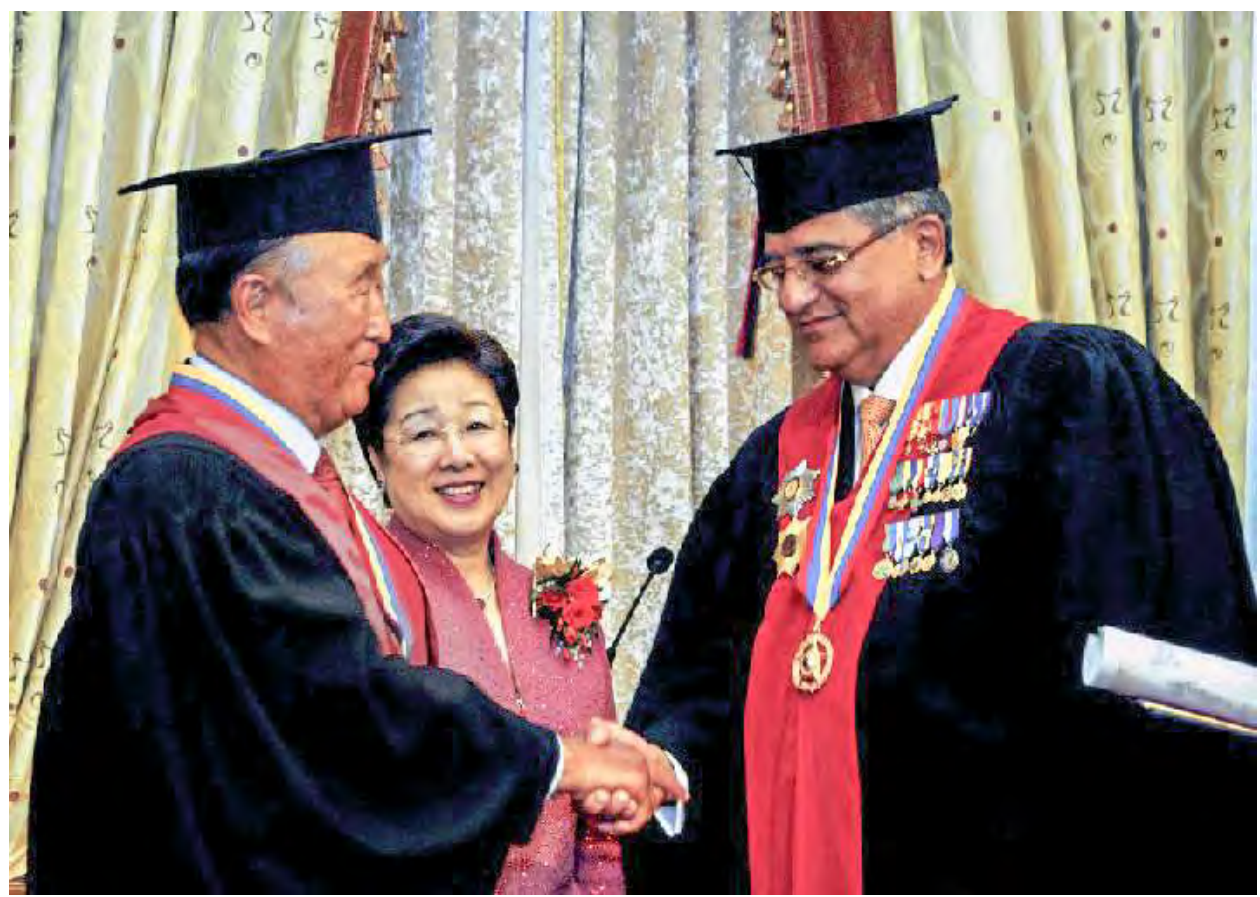
True Father receives an honorary doctorate from the University of Bridgeport September 7, 1995.