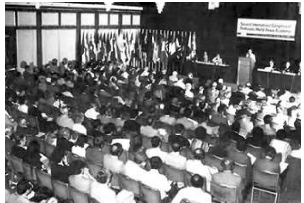
The Second International Conference of the Professors World Peace Academy (PWPA), scheduled for August 13 to 17, convened under the title "The Fall of the Soviet Empire."

August 13, 1985 PWPA Conference on "The Fall of the Soviet Empire"