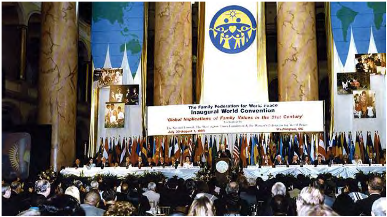
The inauguration of the Family Federation for World Peace and Unification took place in Washington, D.C.

Establishment of the Family Federation for World Peace