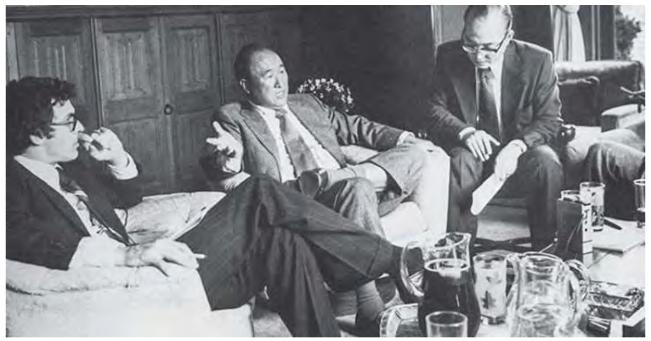
True Father being interviewed for the Newsweek magazine article