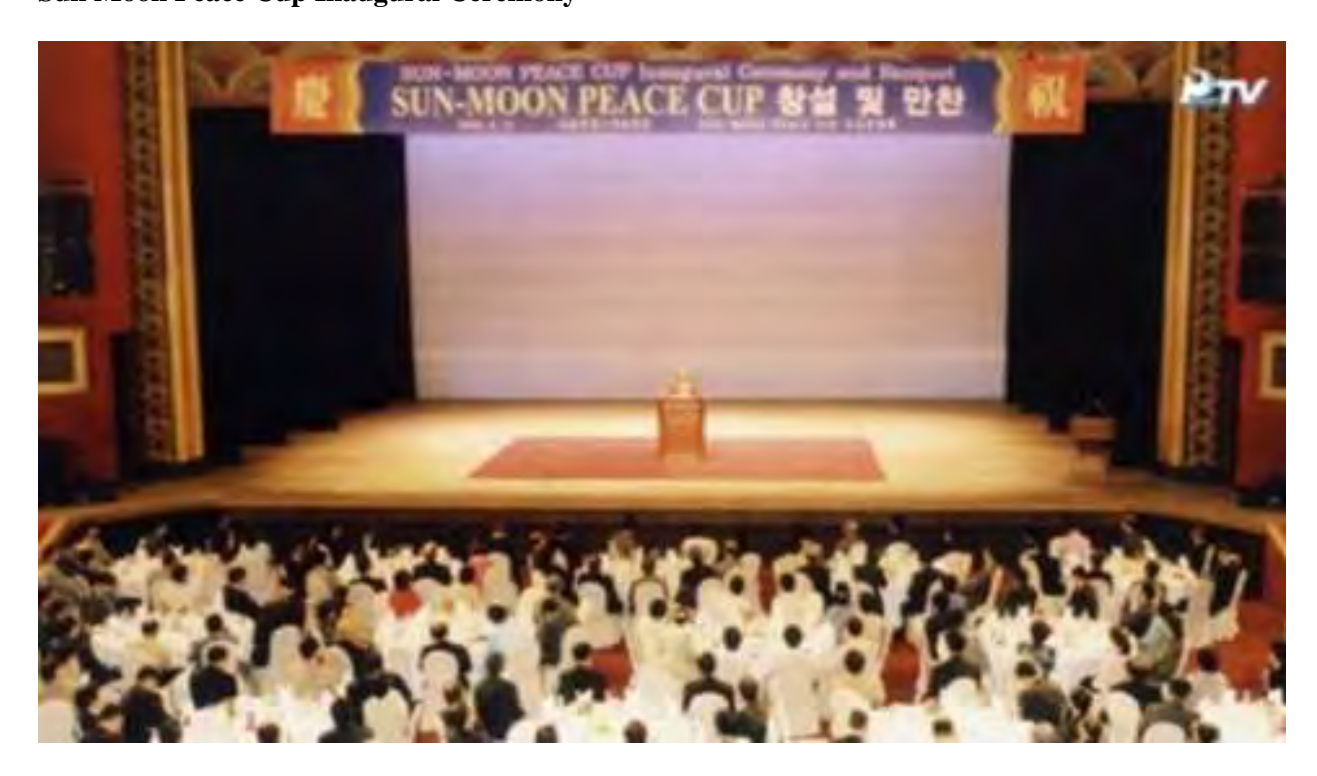
June 12, 2002 Sun Moon Peace Cup Inaugural Ceremony

The Sun Moon Peace Cup Inaugural Ceremony took place at 3 p.m. on June 12, 2002, at the Little Angels Arts Center in Seoul. More than 500 domestic and foreign attendees showed their interest as True Father spoke on seeking "the path to realize world peace through sports." He said that the best soccer club teams in the world would participate in the Sun Moon Peace Cup and that it would "become a festival which hopes for all humankind to become one big family."