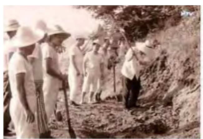
June 17, 1971 Building the Chung Pyung Training Center

The Unification Church was first established in Austria in 1965 with the arrival of missionary Paul Werner. However, in 1974 the church's legal status as a religious association, which had been granted in 1966, was suspended by the Security Agency of Vienna. For decades, Unificationists in Austria fought the stigma placed on them by anti-cult advocates, who branded the association a "threat to public security and order." The Austrian federal government's decision rebutted those prejudicial claims, something that Unificationists in other parts of the world are still fighting for. This recognition came a month after True Mother joined 2,500 Unificationists from all over Europe in Vienna to celebrate 50 years of the Unification movement in Europe.