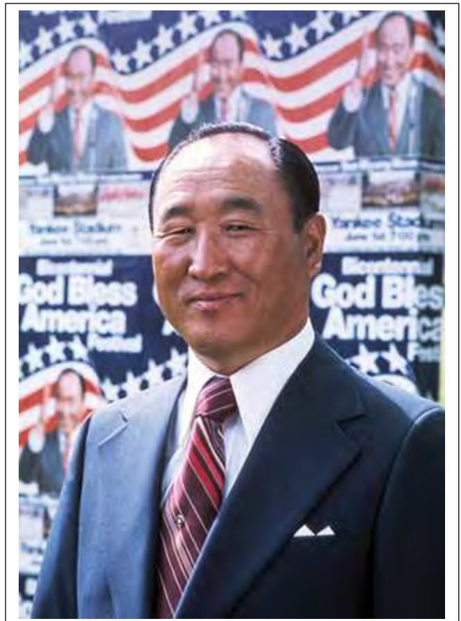
True Father posing for the cover of Newsweek magazine's June 14, 1976, international edition

True Father granted an interview to Newsweek International's executive and general editors. Excerpts from their <u>three-hour</u> <u>conversation</u> were published as part of a cover story on the Unification Church.