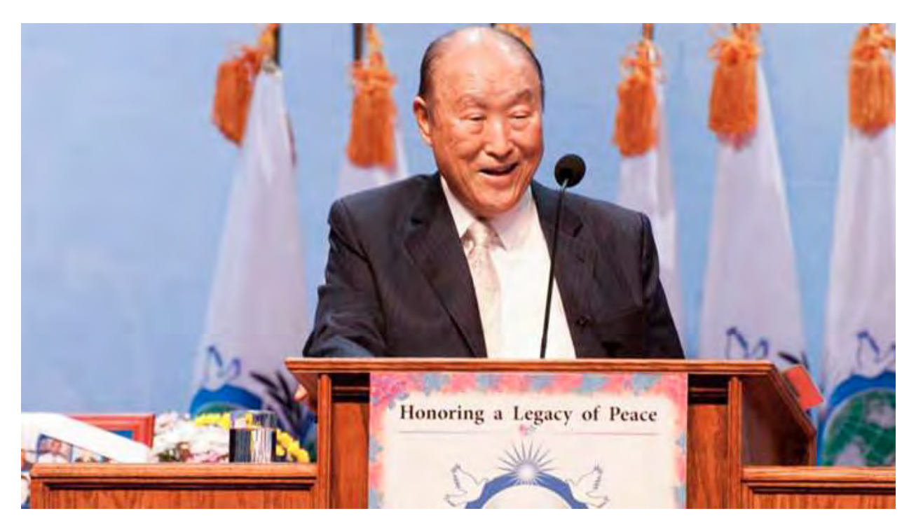
A Tribute to True Parents' Golden Wedding Anniversary and "Legacy of Peace" Honorees

Twelve hundred guests gathered in the Aria Hotel in Las Vegas to pay tribute to the 50th wedding anniversary of True Parents and participate in the final "Legacy of Peace" program in a series that began at the United Nations in March. Organized by the Universal Peace Federation, the event focused on True Parents' lifelong vision to establish a global community of nations and religions—an "Abel UN"—guided by the ideal of "one family under God." It was held during the year of True Father's 90<sup>th</sup> birthday and the publication of his autobiography.